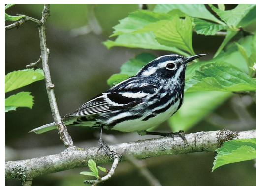
Black-and-white Warbler

When the coast cleared of humans, the squirrels would descend, finding bounteous food on the ground. Approaching a white pine, I heard chickadees. I saw titmice as well, flitting here and there through pine branches. But what was that shape, slightly different, more streamlined? A black-and-white warbler combed the trunk of the pine, its needle beak probing curled fragments of bark, seeking insects to fuel its migration this last day of summer.