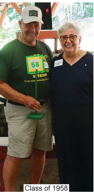
Class of 1958