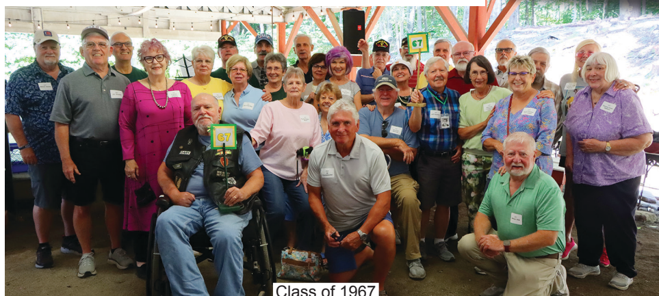
Class of 1967