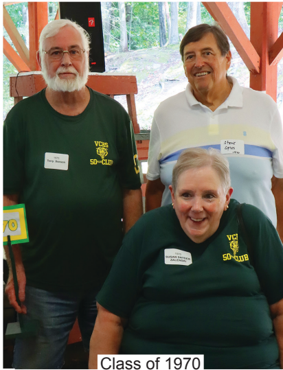
Class of 1970