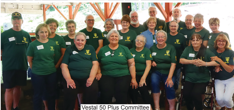
Vestal 50 Plus Committee