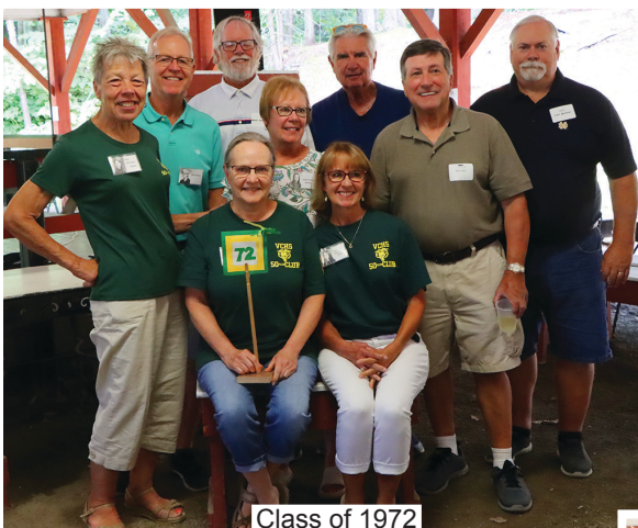
Class of 1972