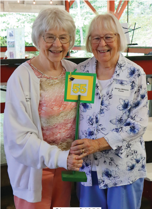
Class of 1955