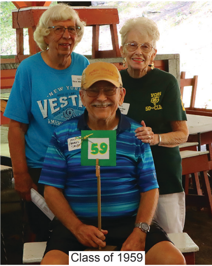
Class of 1959