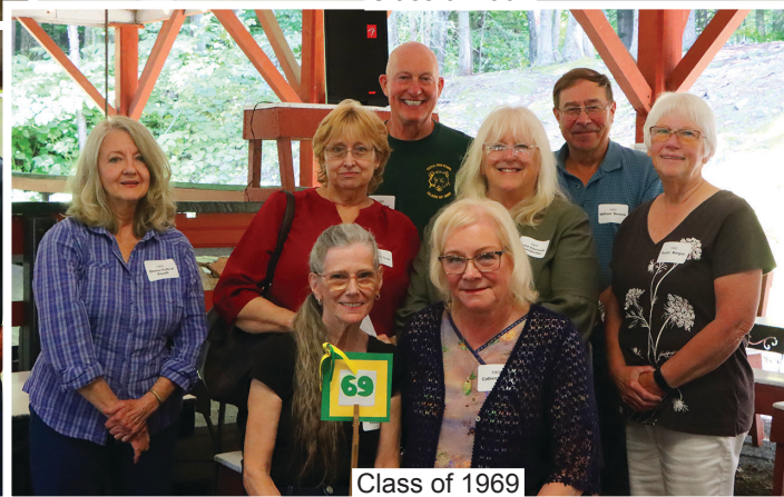
Class of 1969