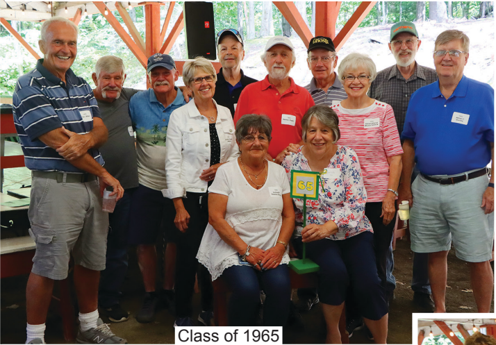
Class of 1965