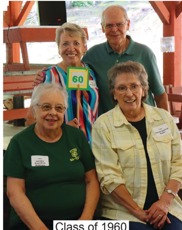
Class of 1960