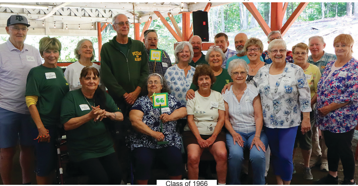
Class of 1966