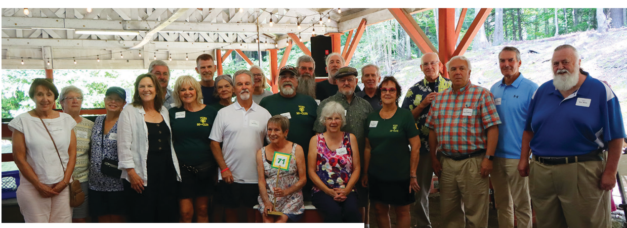
Class of 1971