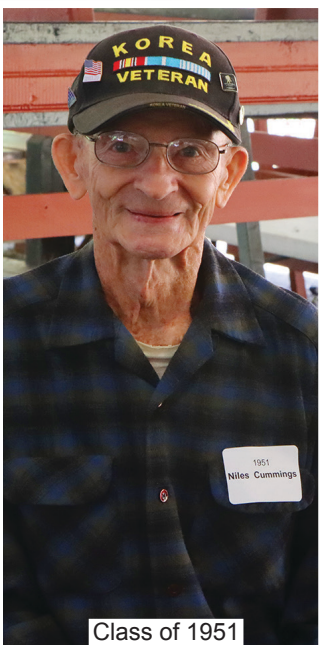
Class of 1951