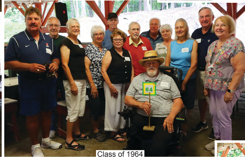
Class of 1964