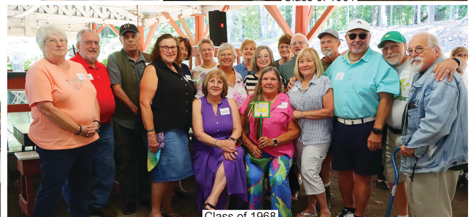
Class of 1968