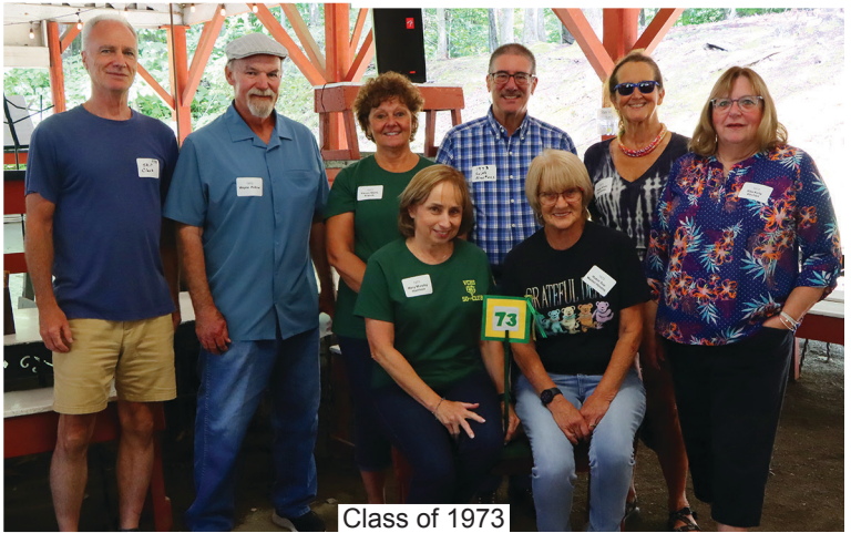
Class of 1973