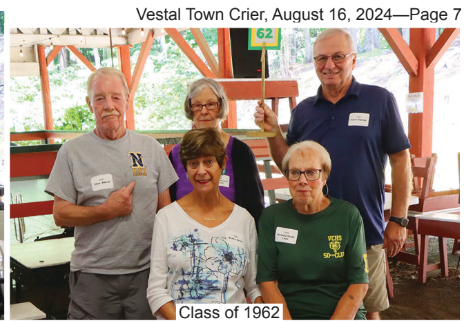
Class of 1962