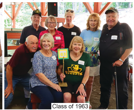
Class of 1963