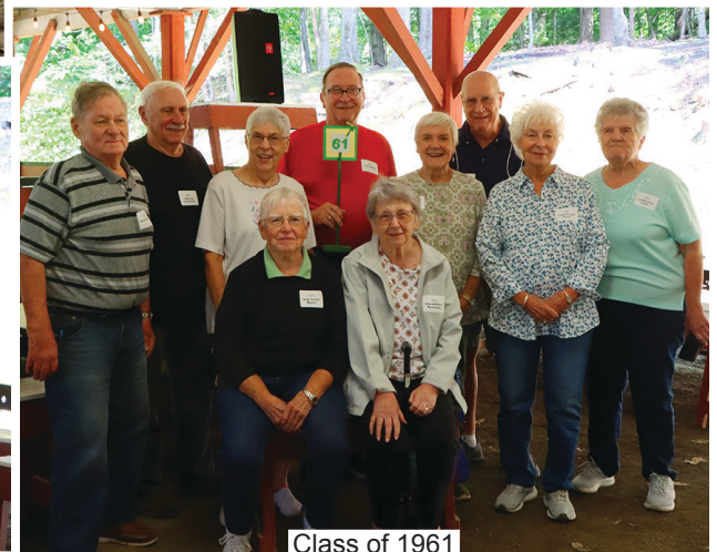
Class of 1961