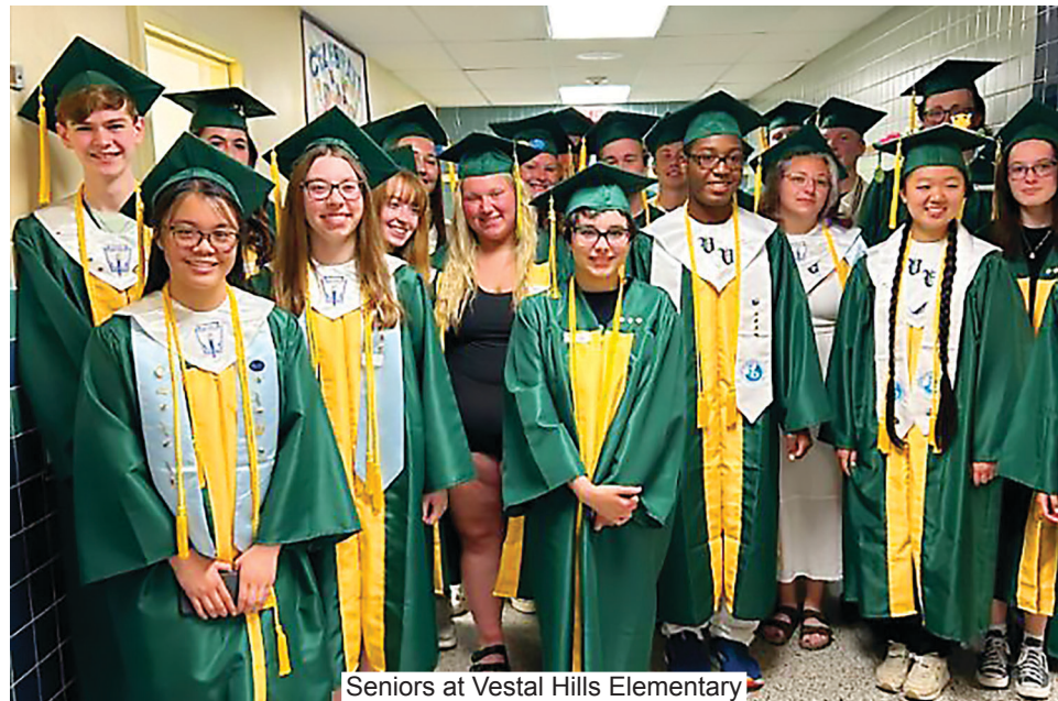
Seniors at Vestal Hills Elementary

SATURDAY, JULY 6 & SATURDAY, AUGUST 24 SIGN UP FOR ONE OR ALL OF THE ABOVE DATES