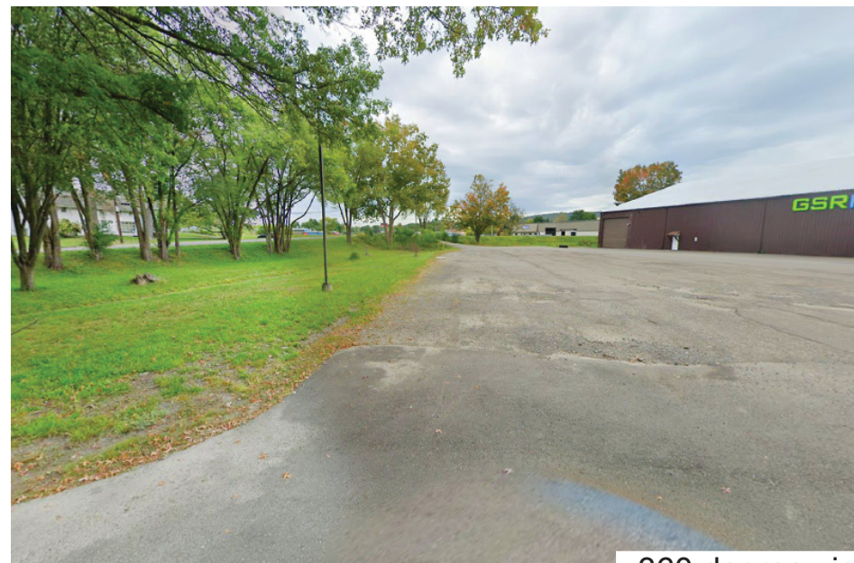
360 degree view of the property