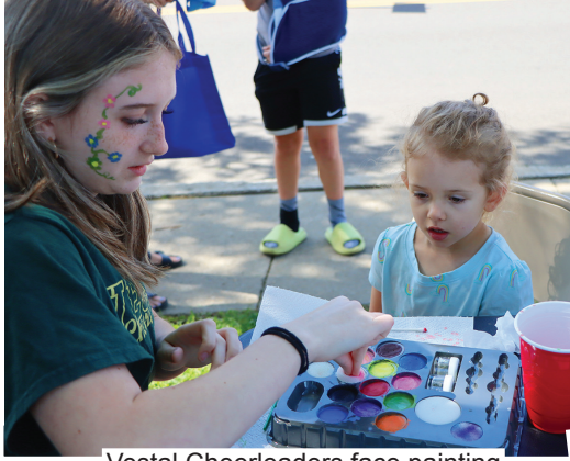
Vestal Cheerleaders face painting