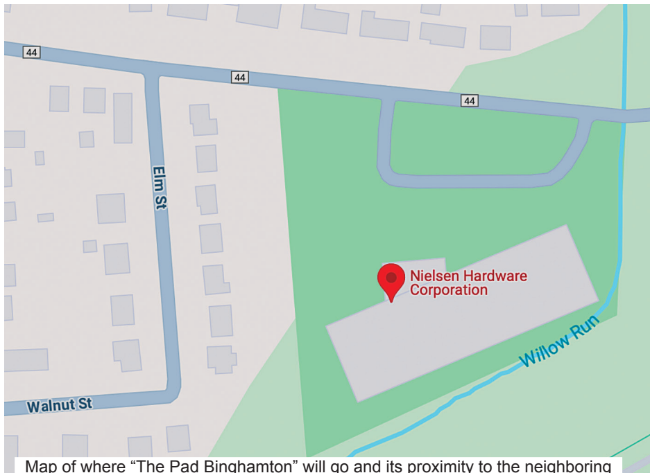
Map of where “The Pad Binghamton” will go and its proximity to the neighboring houses. Nielsen Hardware Corporation will be the location of the glimbling gym.

Part Three, coming next week, will explore excerpts from town board meetings and planning meetings on the subject.