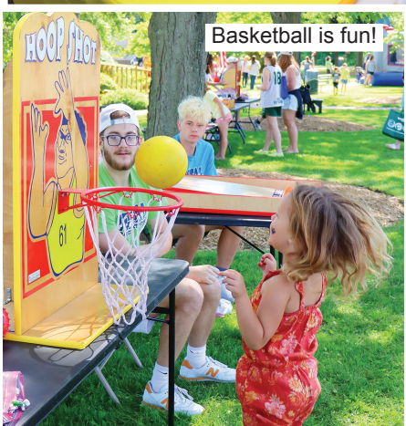
Basketball is fun!