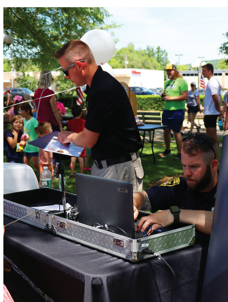
Police Department doing ID cards for kids