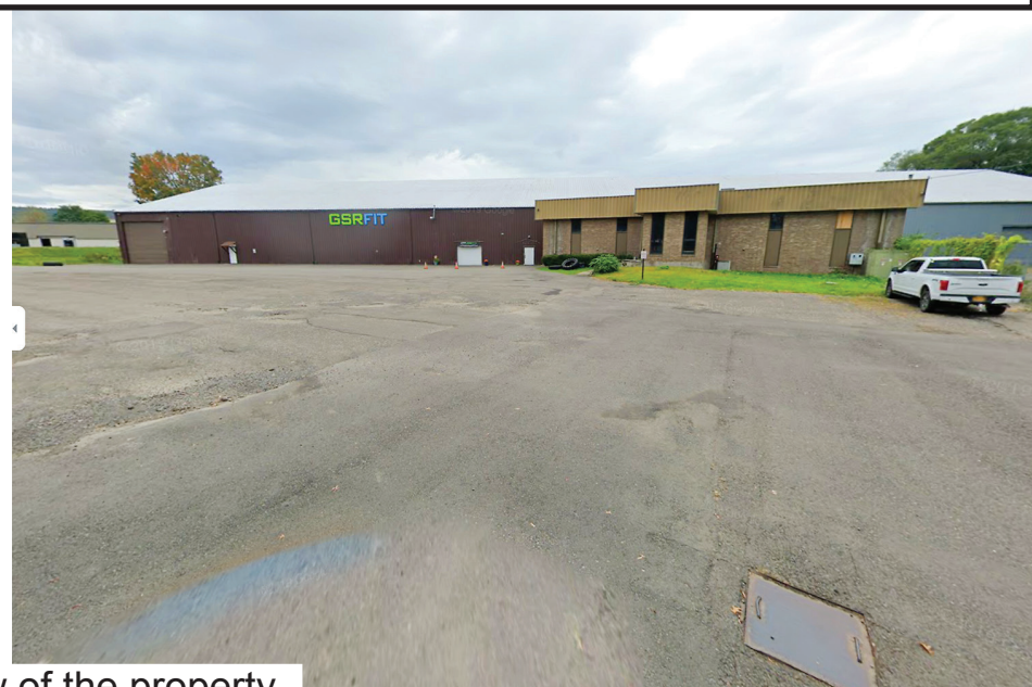
360 degree view of the property