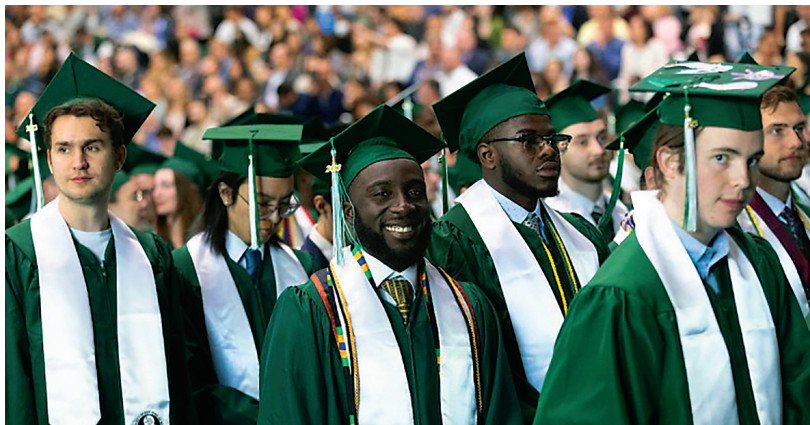
All ceremonies will be held on Binghamton University's Vestal campus.

located in Vestal, NY