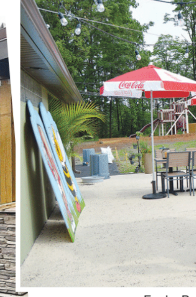
Funky Beez patio set-up