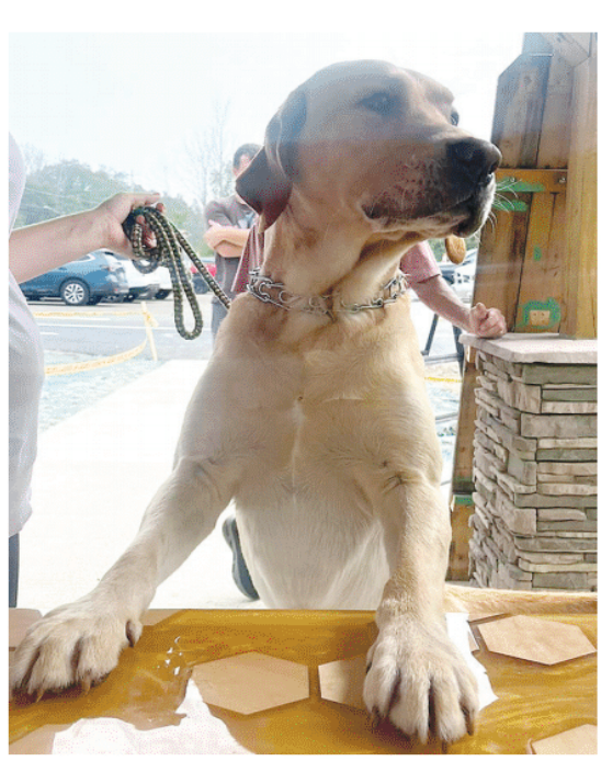
You don't need to be human to have a paws-itive experience!