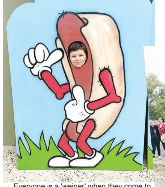
Everyone is a 'weiner' when they come to Funky Beez!