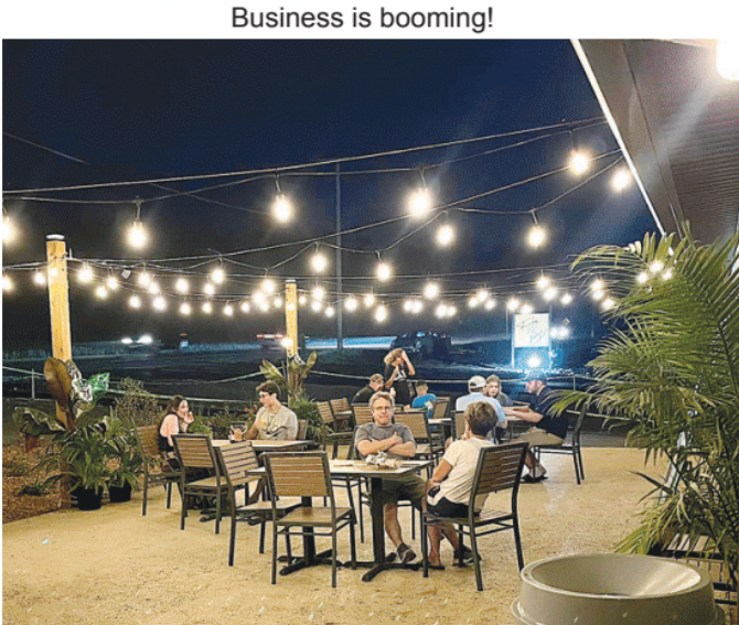
Night time on the patio