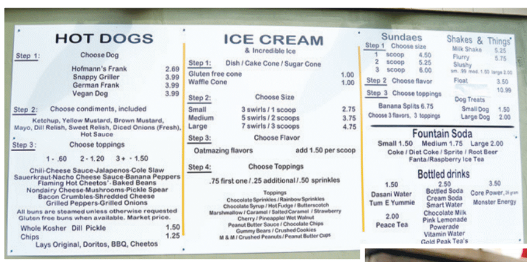
Funky Beez's opening menu