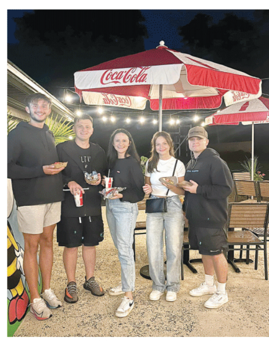
A group of friends enjoy their food!