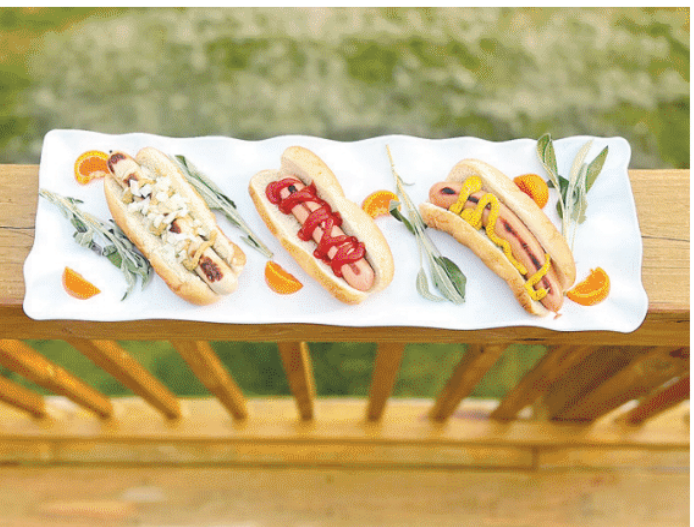
A selection of the hot dogs A big bi