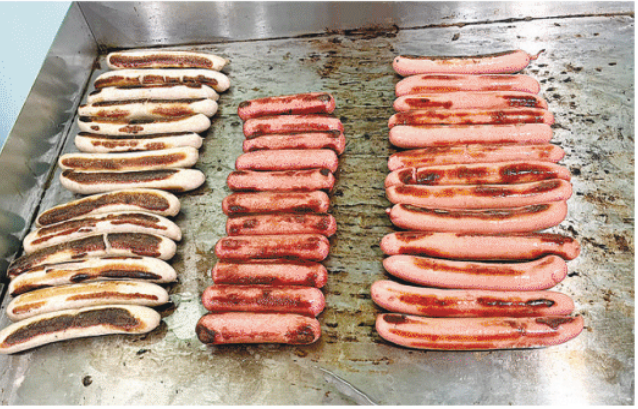
A variety of hot dogs on the grill