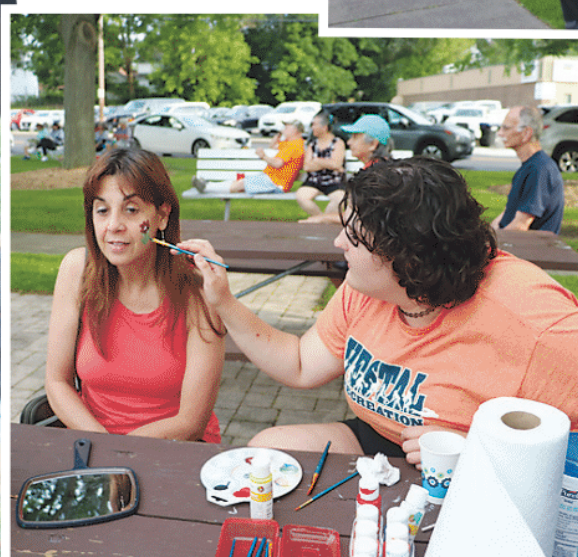
Free Face Painting from the Vestal Rec. Dept.