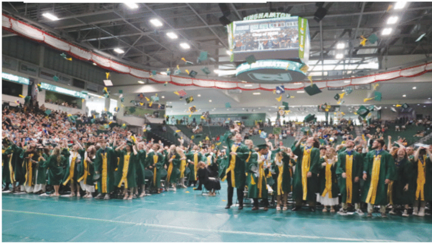
Hats off to the Class of 2023