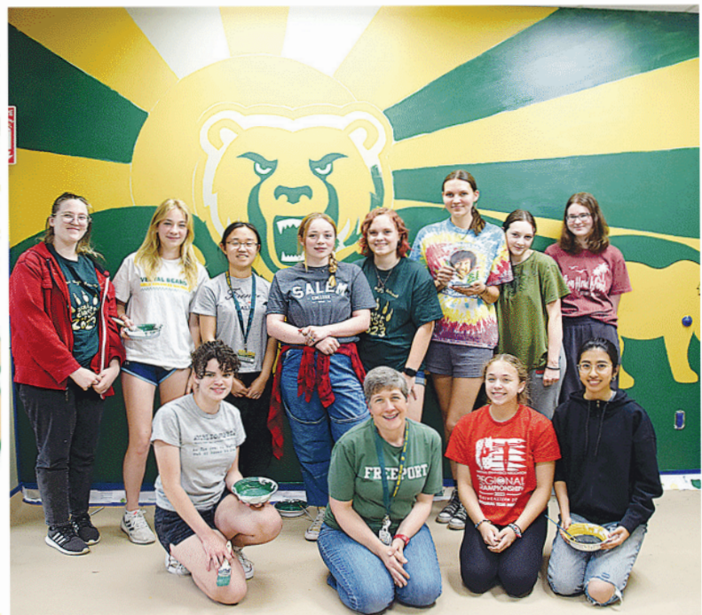
The IB Art class!