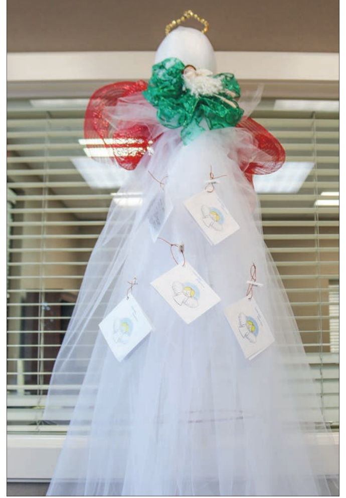
An angel located at the Tri-County Reporter news office.