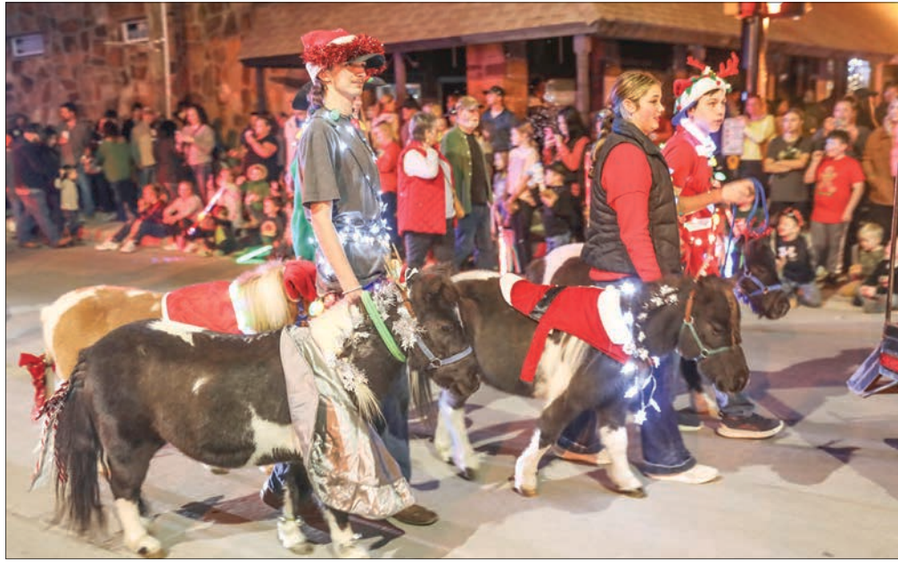
These parade walkers were joined by ponies at Springtown's annual Christmas parade in 2023.

Join the city of Springtown for the sixth annual Old-Fashioned Christmas celebration. This year's event is shaping up to be the biggest festival yet. The event will host dozens of vendors, a kids area full of activities and inflatables, an ice-skating rink, several local performers