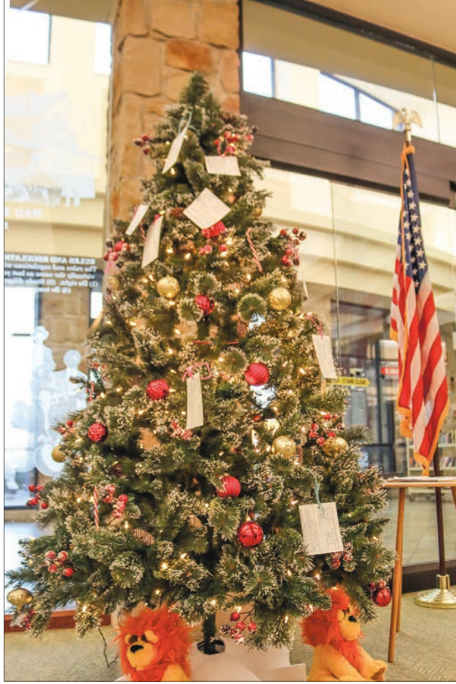
An angel tree located at Azle Memorial Library.

Additional trees and angels can be found throughout town. One angel tree, provided by First Baptist Church Castle Hills, is located in the Tri-County Reporter news office at 321 W. Main St.