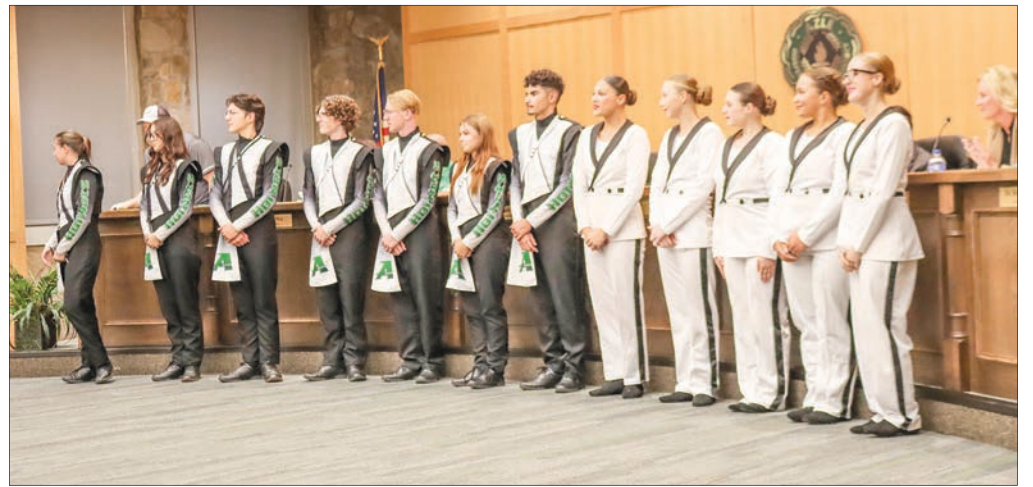
Student leadership of Azle High School's Marching Green Pride at a Nov. 18 school board meeting.