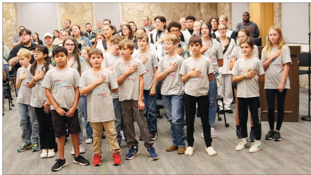
Hoover Elementary students led the United States and Texas Pledge of Allegiance during a Nov. 18 board of trustees meeting.