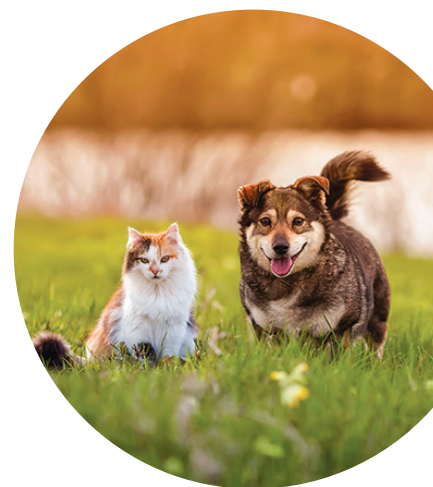
METRO CREATIVE CONNECTION

It can take some trial and error for pet parents to protect their lawns from their furry friend.