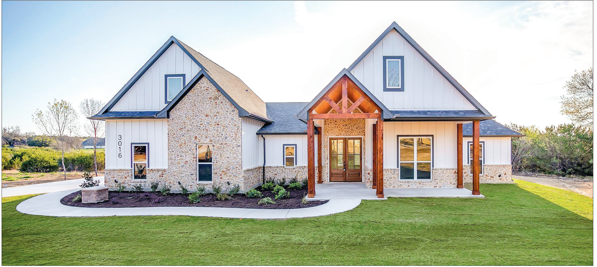
Sorrells Custom Homes will help you design the home that fits your needs.