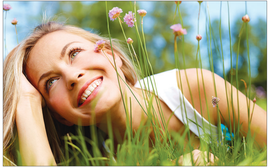
METRO CREATIVE CONNECTION

· Gardeners can still exert some control over native gardens prone to growing a little wild. Borders and paths can better define the growing areas.