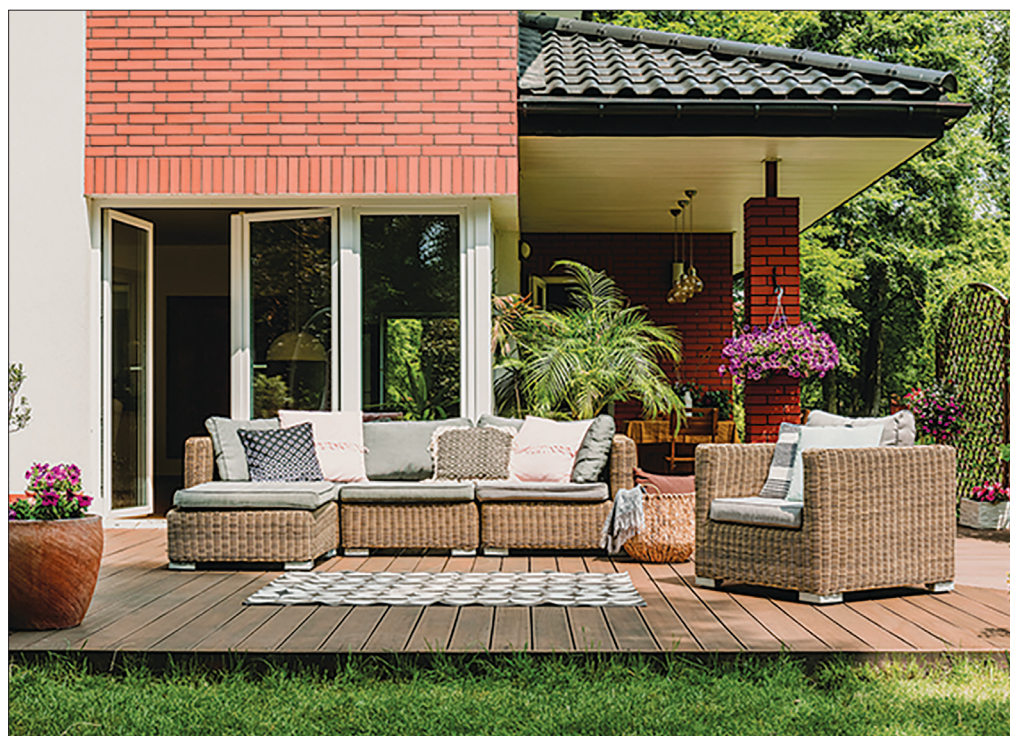
METRO CREATIVE CONNECTION

A pool can be the perfect gathering spot on a warm day, while a spa/hot tub can bridge the gap to cooler weather. According to the