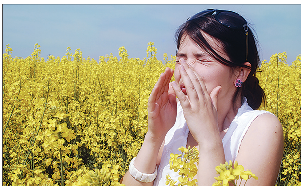
METRO CREATIVE CONNECTION

· Consider allergy shots, also known as allergen immunotherapy. These shots can help desensitize the body to common allergies by using very small amounts of aller-