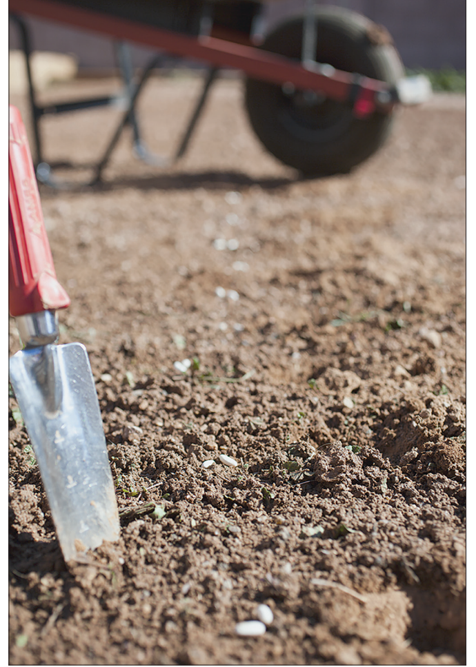
METRO CREATIVE CONNECTION

Spring is a great time for homeowners in various regions to reseed or replant their lawns. With the right approach, homeowners can enjoy a full and lush lawn throughout summer.