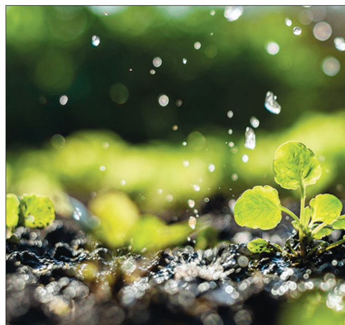
METRO CREATIVE CONNECTION

Discard dead plants and prune any dead branches.