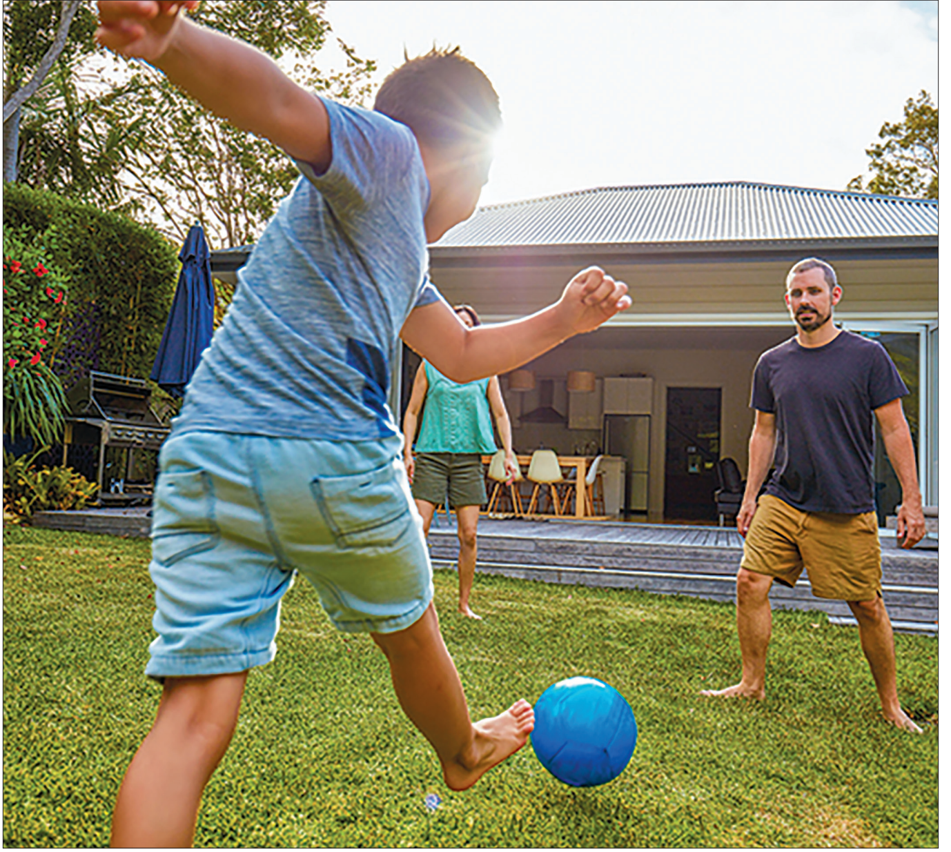
METRO CREATIVE CONNECTION

· Create a tick barrier if your property abuts woods. Woods provide a cover from summer heat that black-legged ticks crave. So properties that abut the woods may be more vulnerable to these unwanted guests than yards that do not border woodlands. A barrier of dry mulch made of wood chips between a property and a bordering wooded area can help repel ticks, who won't want to settle in often dry, hot mulch beds. · Plant with infestation prevention in mind. Some