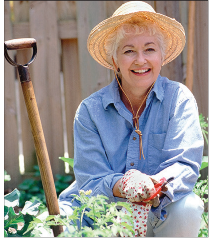
METRO CREATIVE CONNECTION

From knowledgeable and personal sales representatives to highly skilled installers, the team at Texas Designer Flooring is well-trained and held to the highest of industry standards, making sure that each customer experience is exceptional and consistent. We guide our customers and designers along every step of the process, knowing that great service follows the customer long after the sale and installation.