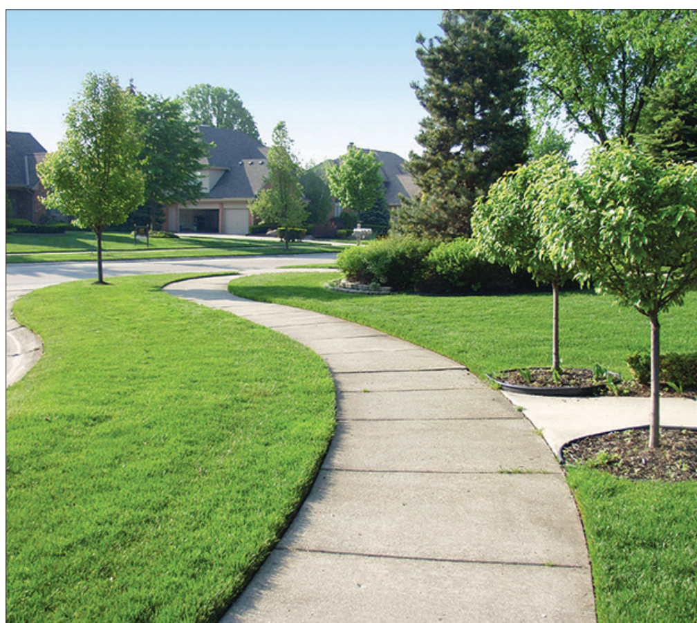
METRO CREATIVE CONNECTION

Mowing too frequently or at too low a height may compromise the lawn's ability to thrive. Grass cut to the proper height develops a deep root system to better locate water and nutrients in the soil. That means homeowners may not have to water as much or as frequently. Taller lawns also shade the soil and the roots, reducing some evaporation.