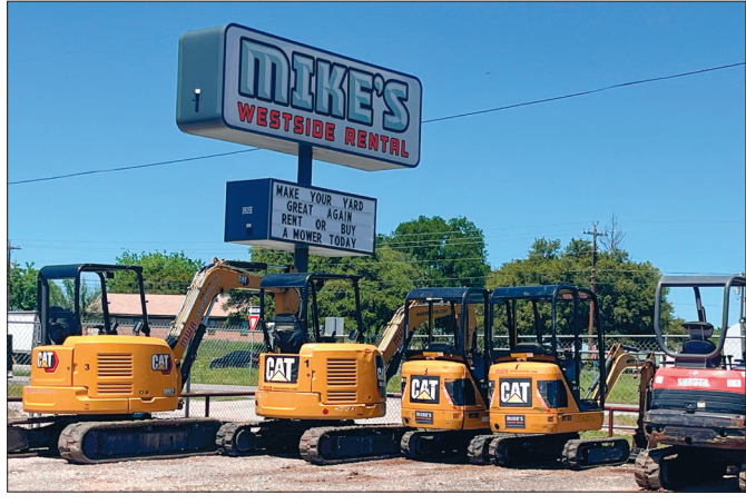
Mike's Westside Rental is located at 1363 Northwest Parkway in Azle.

No matter how big or small your home projects are this spring, the team at Mike's Westside Rental will help you get them done. Follow them on Facebook and visit their website www.mikesrental.com to check out any upcoming specials.