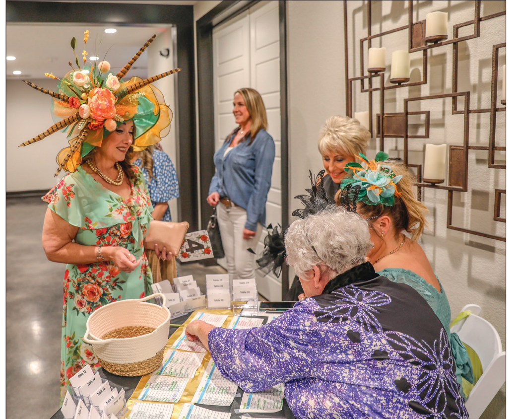
Signing in at the Springtown Area Chamber of Commerce Annual Awards Gala.