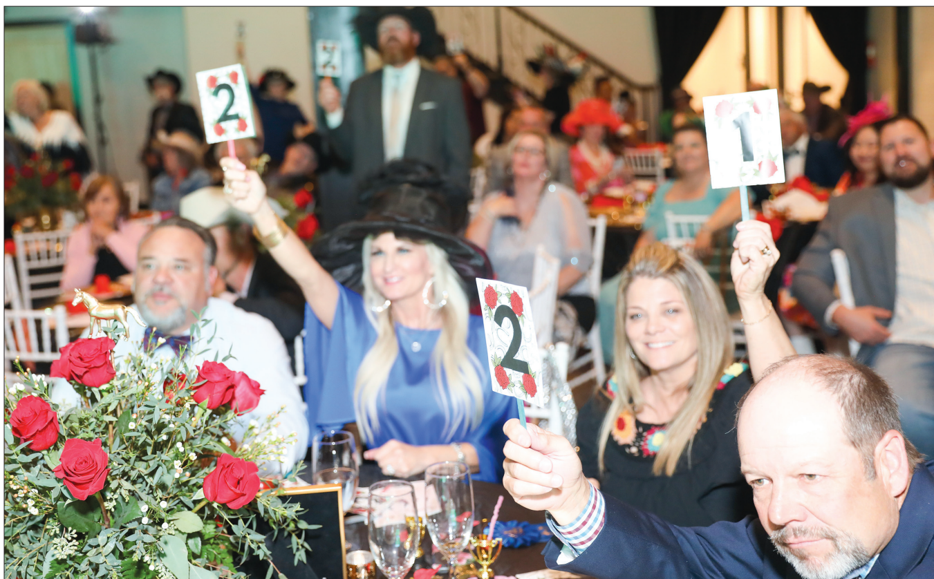
Attendees at the gala played the horse racing game