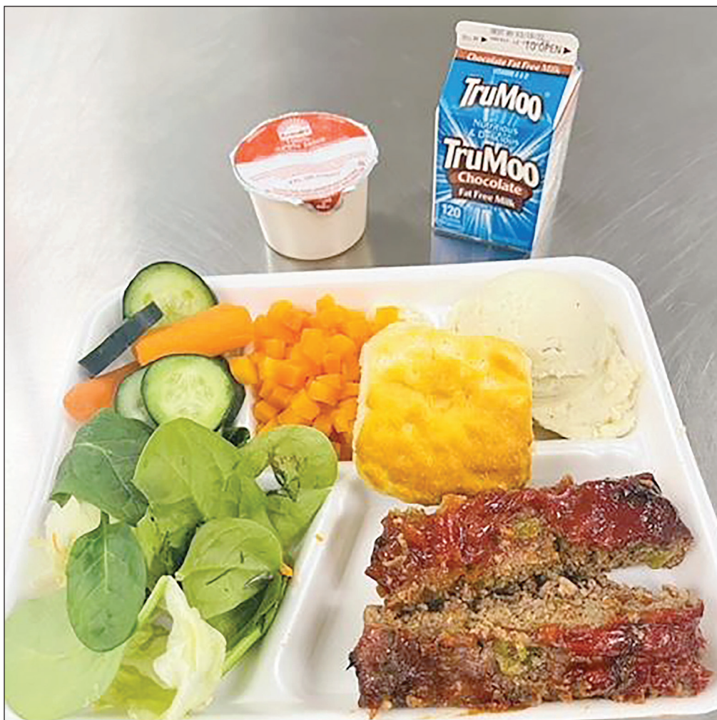
In the summer program, the district offers a lot of the same products that are offered in the school year.

"For example: In the campuses we will offer pizza, chicken sandwiches, hamburgers," Venable said. "The