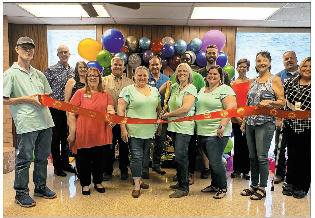
Azle Area Chamber of Commerce joined Survivors Studio on May 19 for their grand opening and ribbon cutting in Azle. Survivors Studio is a safe place for those who have experienced trauma to begin/renew their journey toward healing. They offer group therapy and a monthly studio session for those who want to experience what the Studio is about in a relaxed format. Check out their website for more information www.survivorsstudiotx.com .