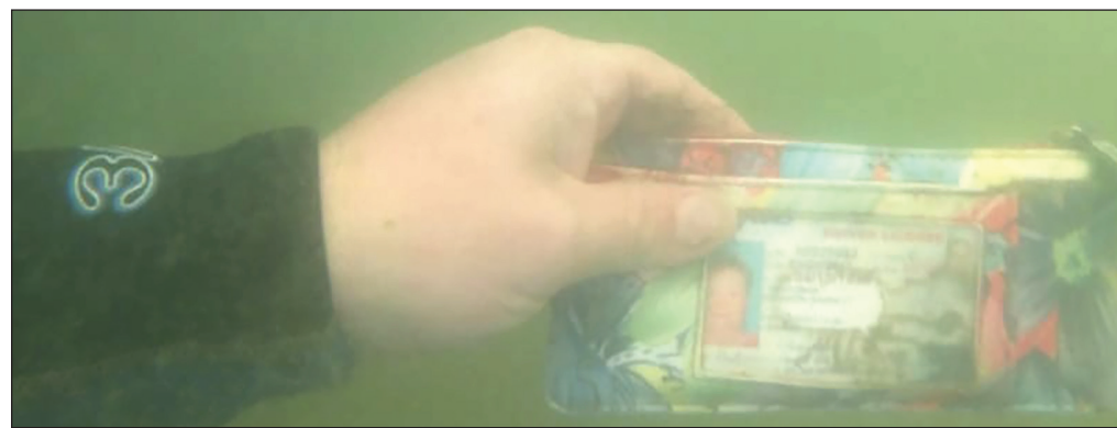
A woman's waterproof wallet that was lost overboard.