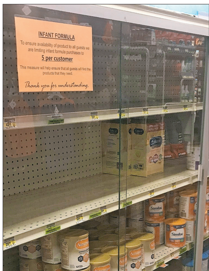
Area stores are limiting formula purchases for families until supplies are back to normal.

Texas was among the states with the "highest levels of sold-out baby formula products," with 53% of the top-selling products sold out as of May 1, according to CBS News.