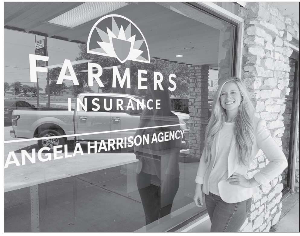
Angela Harrison Agency strives to make sure that you fully understand your coverages and that your time is valued. They know your time is limited and work hard to be mindful of that.