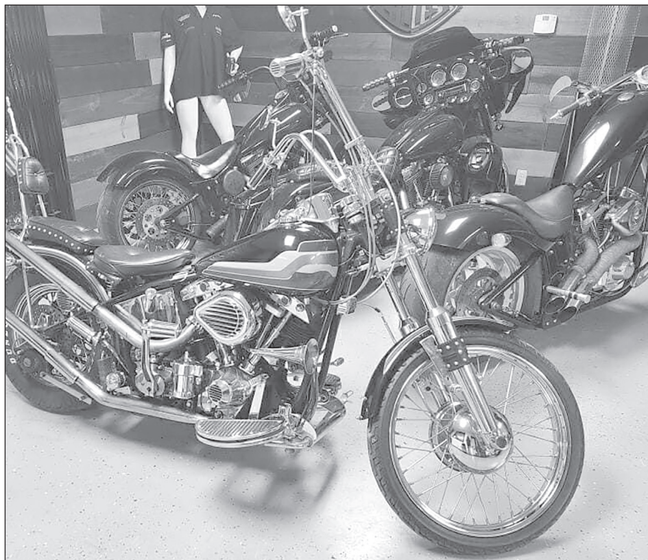
Prodigy Motorsports is open Tuesday through Saturday from 9 a.m. to 6 p.m. and scheduled appointments are available. Be sure to visit them at 5210 E. Hwy 199 Springtown, TX 76082 where "the fridge is always stocked with cold drinks for hot Texas days."