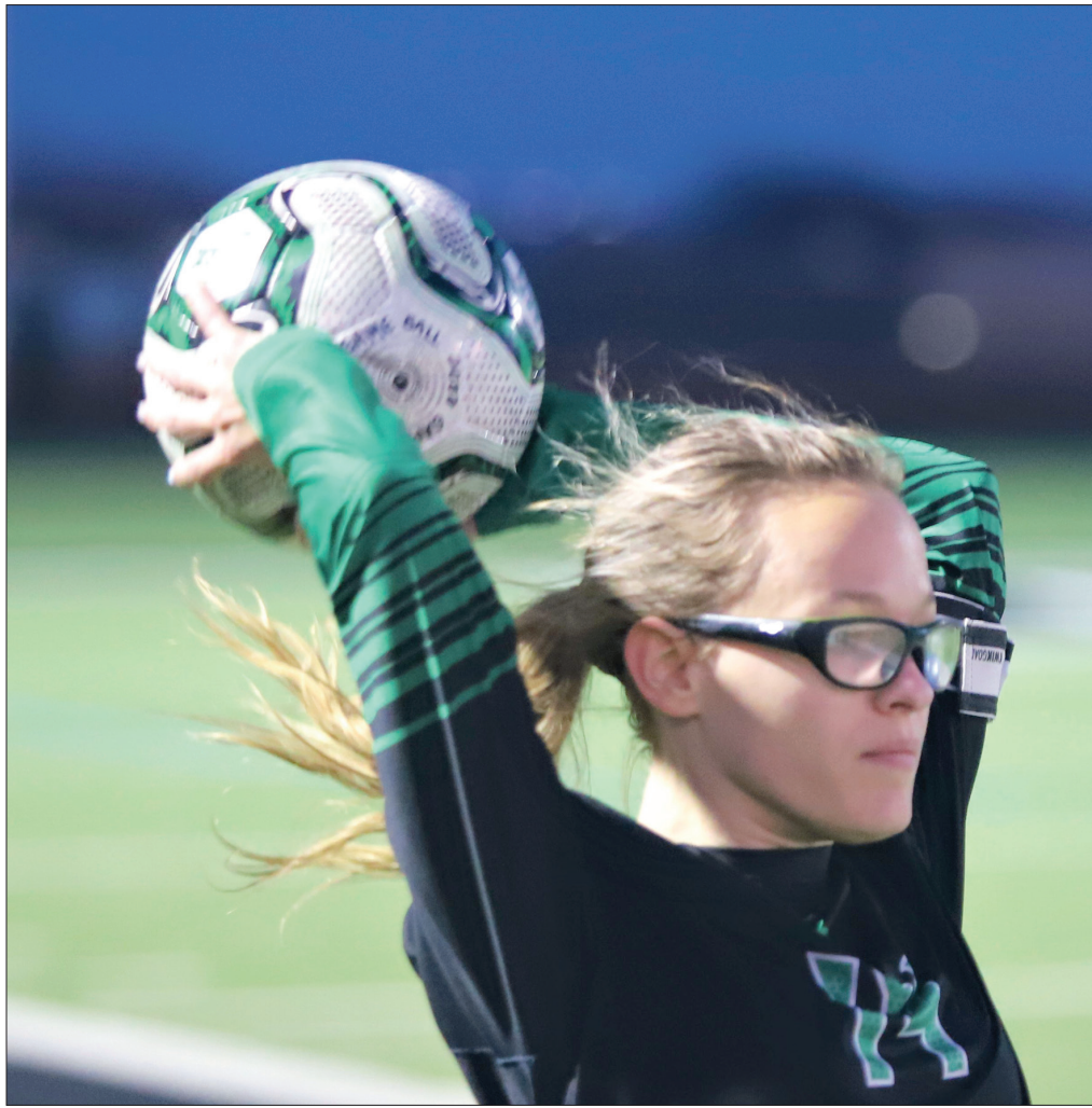
JEFF PRINCE | AZLE NEWS