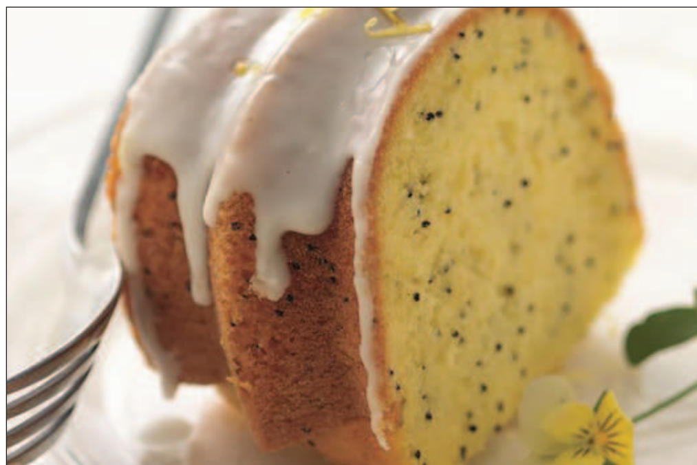
STORY AND PHOTOS COURTESY OF METRO CREATIVE CONNECTION