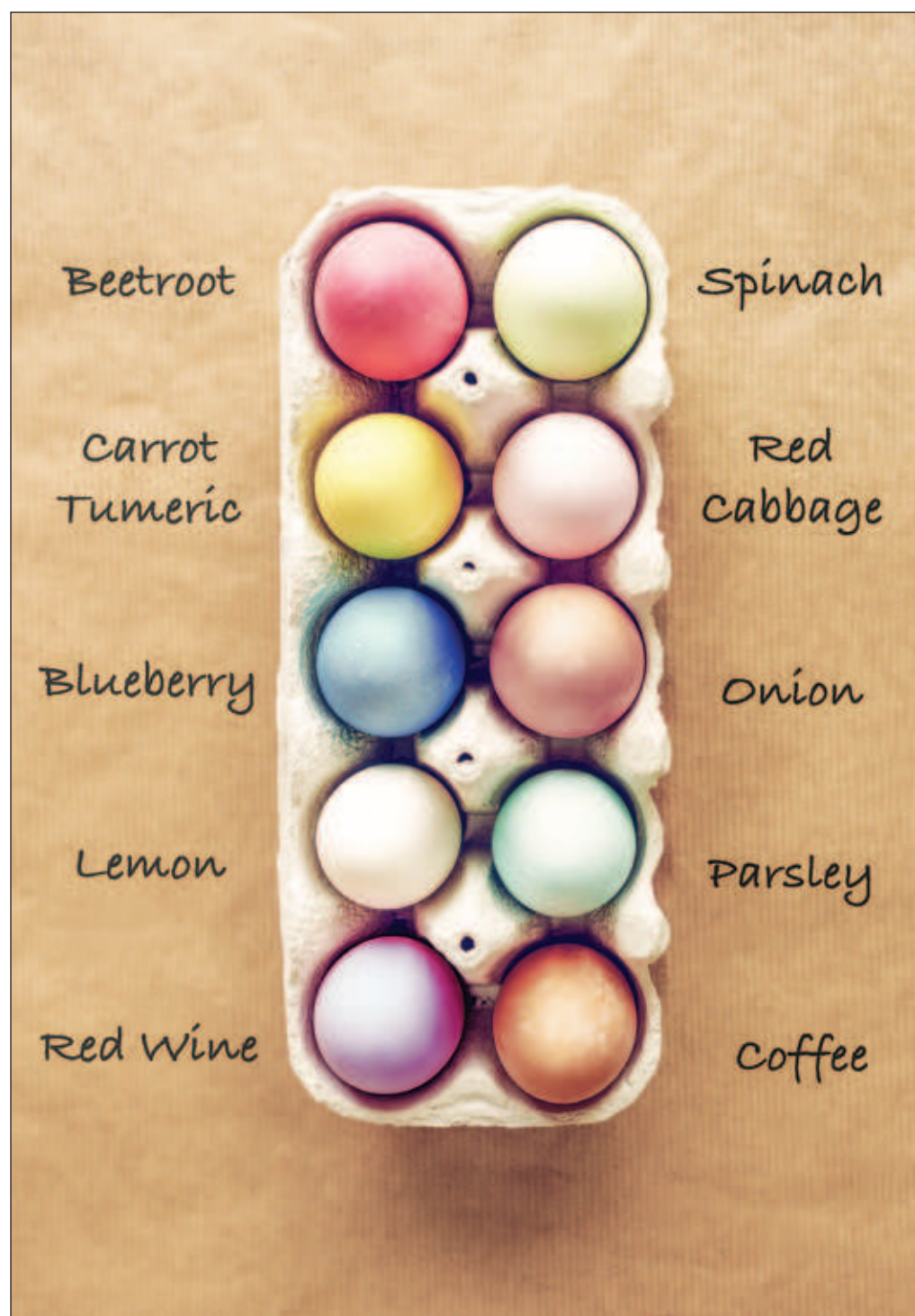
Avoid artificial dyes this year and color your eggs with natural ingredients, like beets, cabbage and turmeric.

Coloring Easter eggs is a time-honored tradition passed down from generation to generation. Easter eggs symbolize rebirth, which fits in well with both religious and seasonal celebrations.