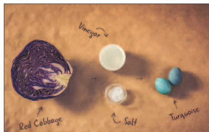
The secret ingredient to beautiful blue eggs is shredded red cabbage.

and 1 tablespoon of salt in a saucepan. Bring it to a boil, then reduce and simmer for 30 minutes. Strain the mixture and allow to cool. Add 2 tablespoons of vinegar. Use the solution for red and pink eggs.