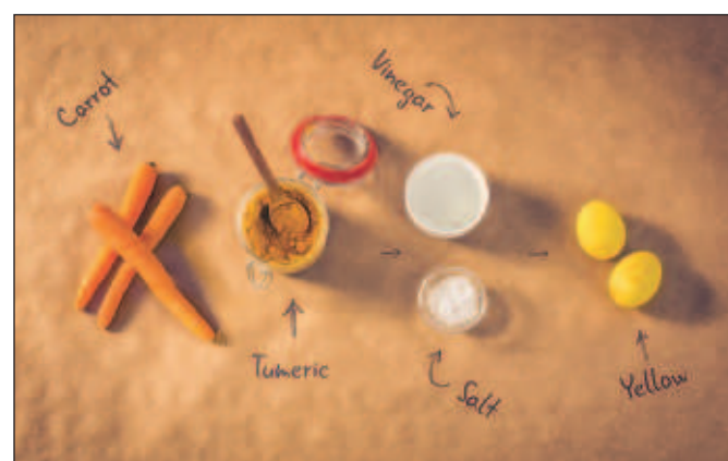
Yellow eggs can be dyed with a common household spice and some tasty carrots.

Use beets to create pink and red eggs. Take 1 or 2 beets and roughly chop them. Combine with 4 cups water