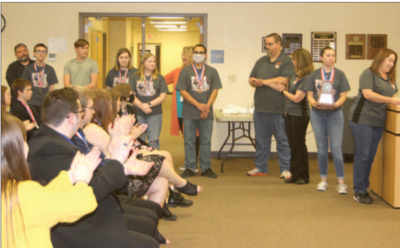
The audience at the Springtown ISD school board meeting on Monday applauds the successes of Springtown High School's Academic UIL team.