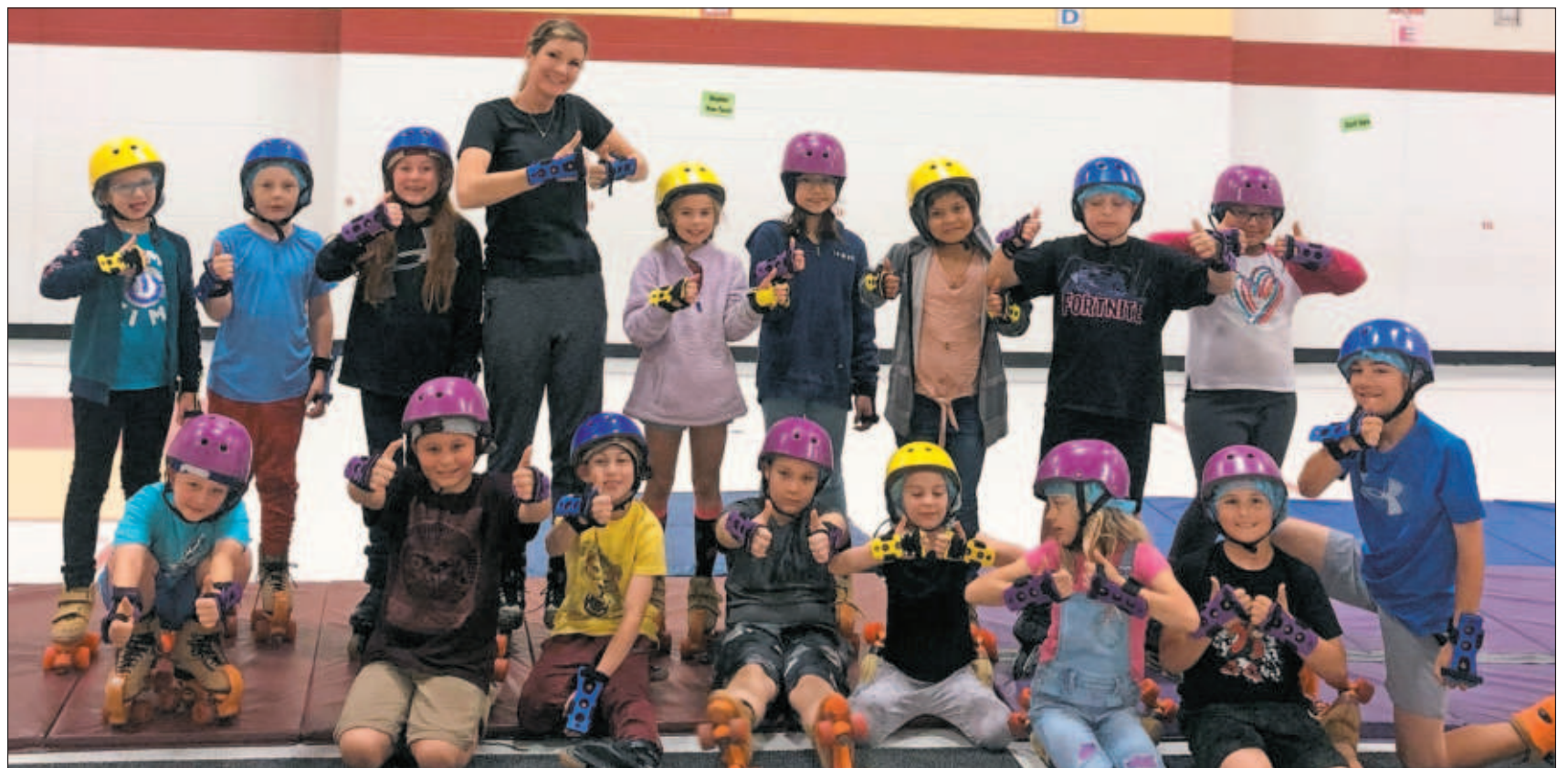
Reno Elementary School students participated in a roller-skating event last year.

"Many families do not have the money for this event, so I asked local businesses to sponsor my event," she said. "Red's Burgers, Maggie's Hair Salon and Tried & True Candles gave a generous amount of money. I also had Reno parents giv-