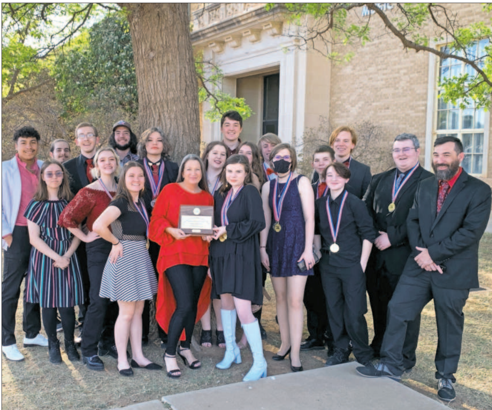
Springtown High School's UIL One-Act Play company students will advance to the state competition with their performance of "The Tin Woman."