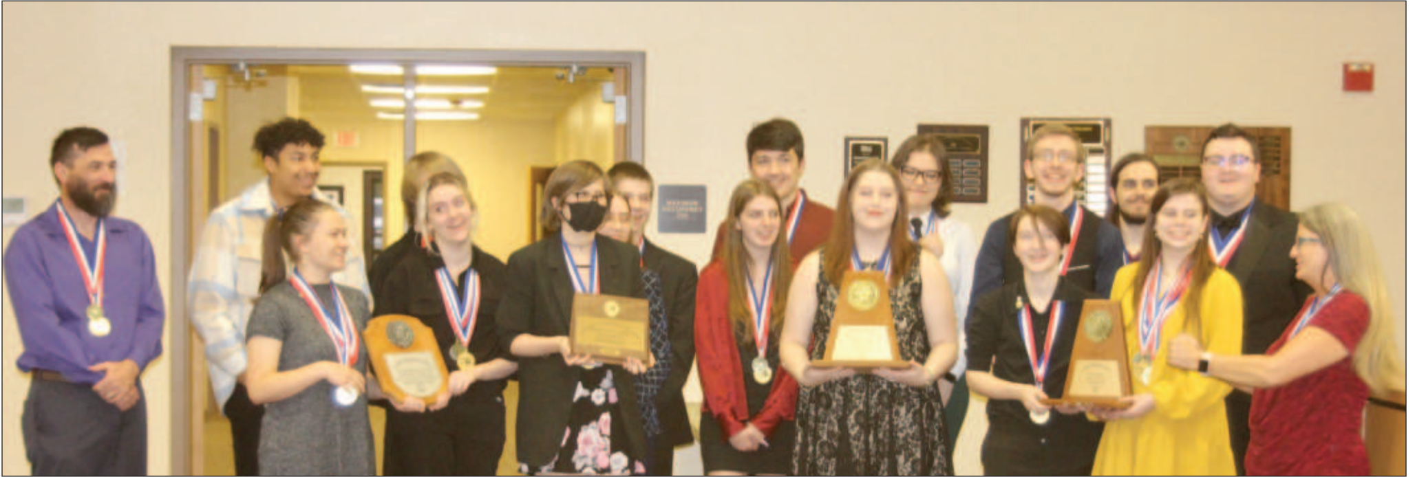
Springtown High School's One-Act Play company was recognized by the Springtown ISD school board on Monday for advancing to the state competition.