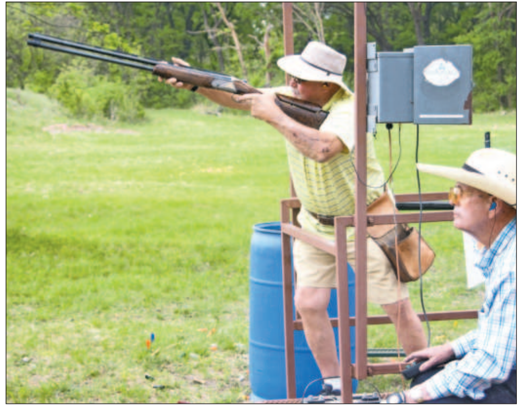
The Springtown Area Chamber of Commerce, along with natural gas company Colt Midstream, hosted the 11th annual Sporting Clay Shoot on Friday at Fossil Pointe Sporting Grounds in Decatur. The event proceeds benefitted the Springtown Area Chamber of Commerce.