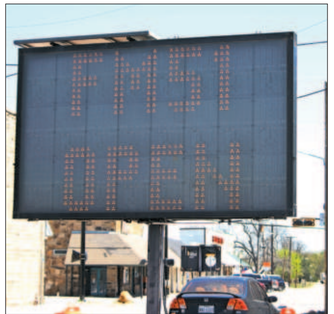
FM 51, including the FM 51 and State Highway 199 intersection, reopened on April 7.