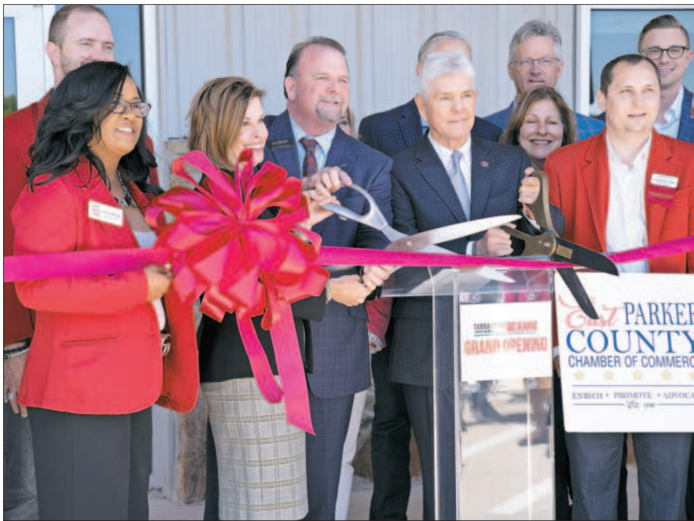
Local leaders and members of the Weatherford and East Parker County chambers of commerce attended the grand opening of the new Tarrant Area Food Bank West, which will help serve more communities outside of Tarrant County.

While eliminating hunger is its priority, TAFB West is also looking to assist its clients with access to local resources to stabilize their lives, including nutrition, health and wellness classes, demonstrations on healthy cooking, diabetes prevention, and gardening.