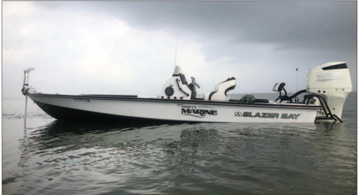
Smaller craft are obviously more impacted by the wind, but even larger craft can get swamped if the conditions are right.

Spring winds can put a windy April. Lake wind dampener on the fishing, especially when you have lake wind advisories. Lately, it seems that we are having a windy April. Lake wind advisories are typically issued with forecast of winds over 20 mph. If you do get on the water and the winds are