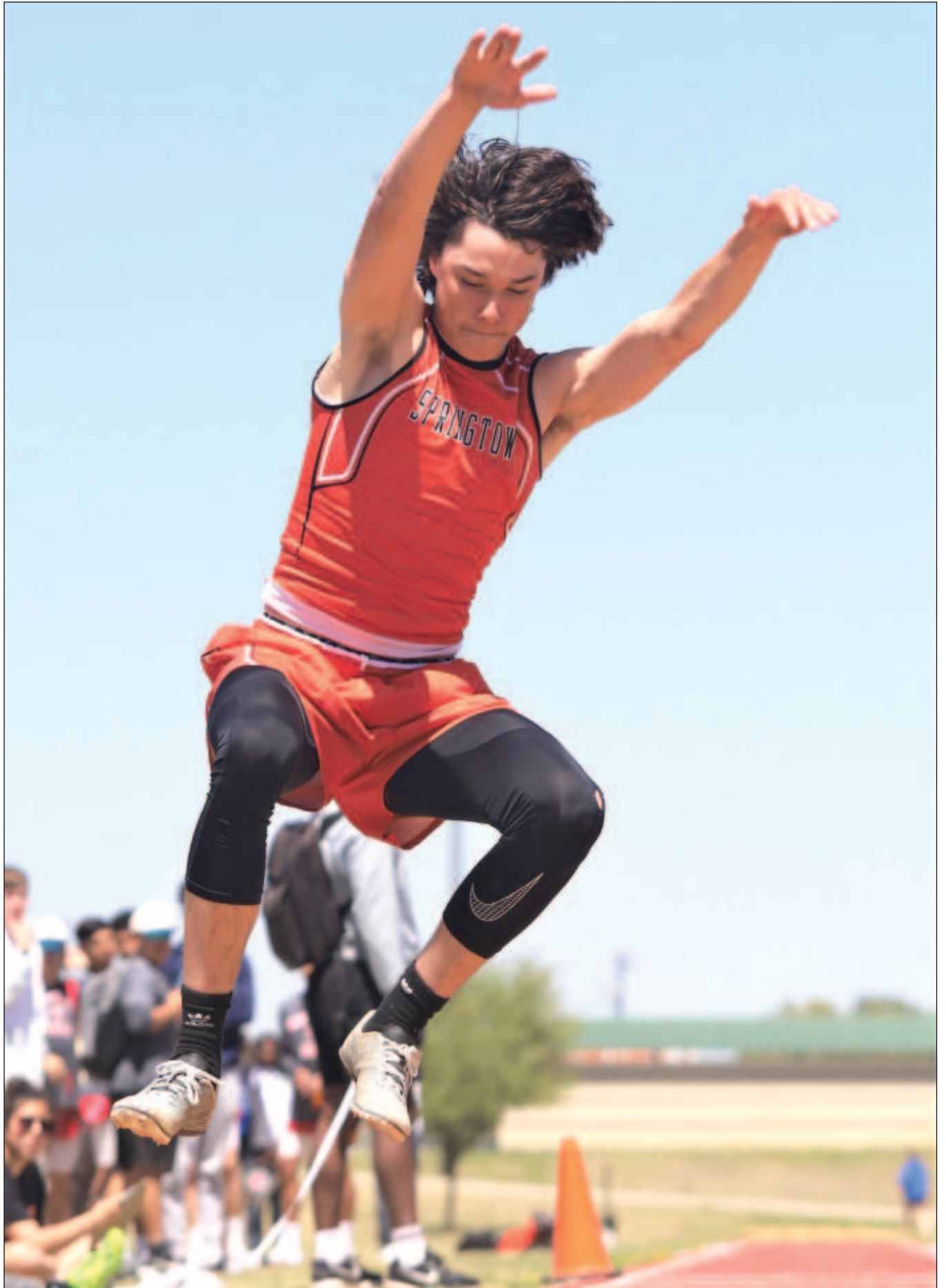
SEE JUMP, PAGE 2B.