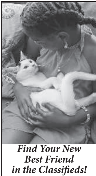
Find Your New Best Friend in the Classifieds!