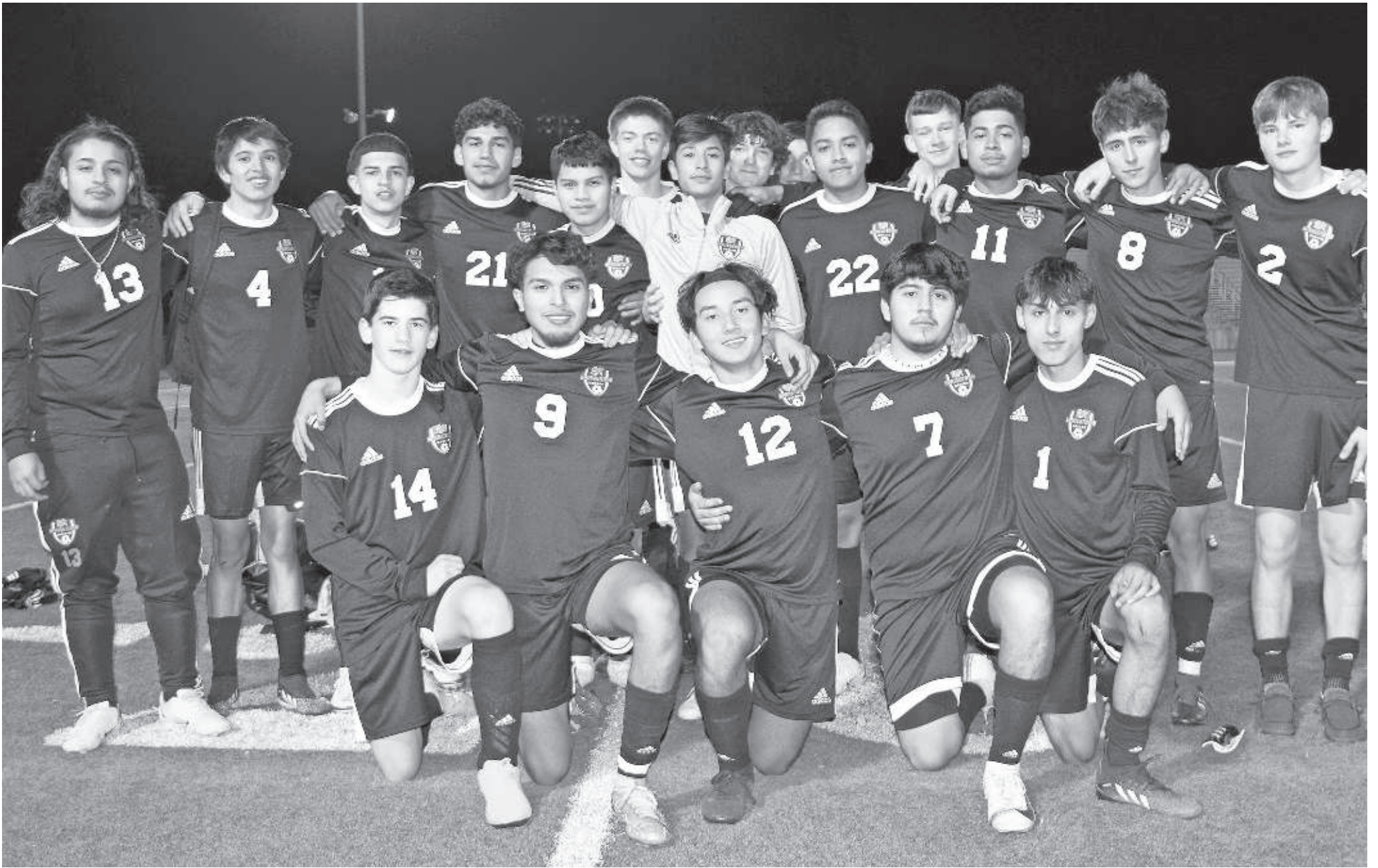
Springtown's soccer boys lost their season opener but have high hopes for the season.

at Sewanee University of the South in Tennessee.