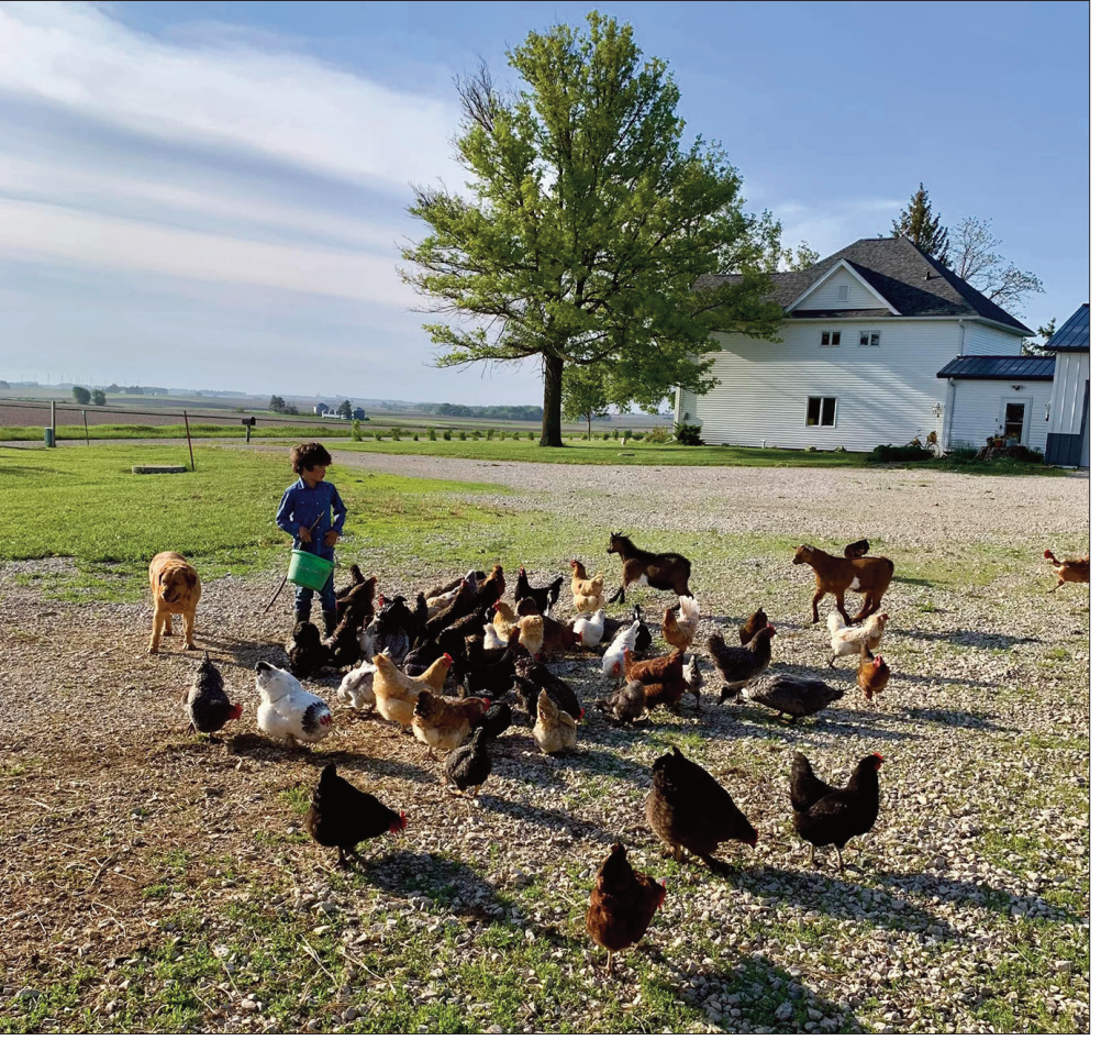
The hens are fed on a sunny morning

herbs, apples and veggies), refrigerator pickles and occasionally baked goods. They hatch and sell chicks. They plan to add fresh cut flowers this summer.