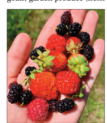
Strawberries, mulberries and raspberries

The Nelsons sell eggs, goats, garden produce (fresh