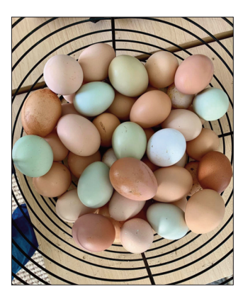
A basket of freshly gathered eggs.