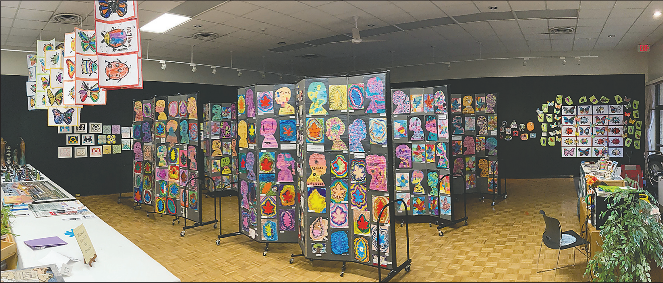
Elementary and early elementary artwork is displayed on panels and from the ceiling.