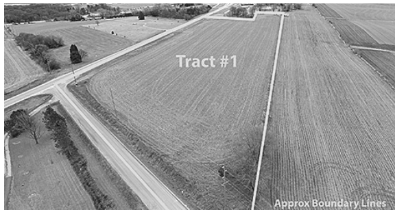
Tract 1: 12.26+/- Acres Located Just North Of Cherokee, IA On HWY 3

Upcoming Live Public Farmland Auction Of 3 Tracts Of Farmland Located In Cherokee TWP, Cherokee County, IA Just North Of Cherokee, IA These Tracts Of Land Are Located Just On The North Edge Of Cherokee, IA!