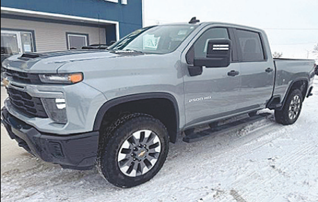
2024 Chevy 2500HD Crew Cab Custom, 18k, 6.6L Gas, Cloth, 1 Owner

We're Celebrating 100 Years!! www.rexchevrolet.com Odebolt, Iowa 712-668-2296 or text 712-369-0180