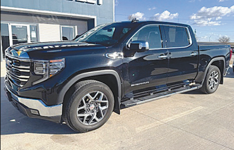
2022 GMC Crew Cab SLT, 66k, Htd Leather, 20's, 1 Owner, Loaded