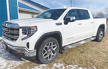
2022 GMC Crew Cab 1/2 SLT, 27k, 6.2L, 1 Owner, Htd Leather, 20's, Loaded