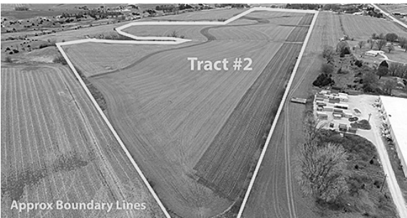
Tract 2: 73.34+/- Acres Of Farmland With A CSR2 Of 88.9