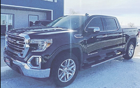
2019 GMC Crew Cab 1/2 SLT, 55k, Htd Leather, 20's, Remote Start, Loaded