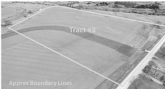
Tract 3: 28.81+/- Acres Of Farmland With A CSR2 Of 91.9