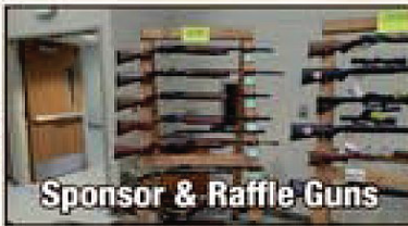
Sponsor & Raffle Guns