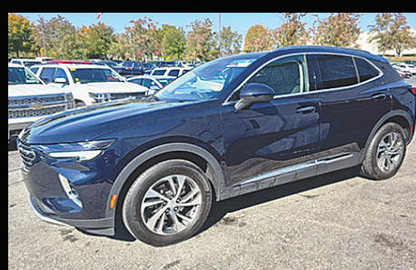
2021 Buick Envision AWD Essence, 32k, Htd Leather, Camera, Lane Departure, Loaded