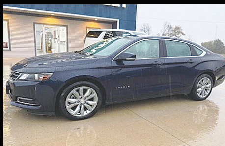
2018 Chevy Impala LT, 99k, Htd Cloth, New Tires