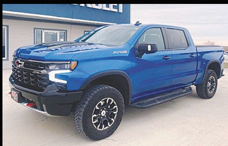
2022 Chevy Crew Cab 1/2 4x4 ZR2, 48k, 6.2L, Htd Leather, Moon, HUD, Loaded