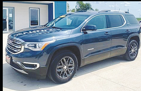
2019 GMC Acadia AWD SLT, 59k, 1 Owner, Htd Leather, Moon, Quads