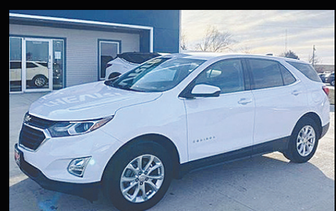
2020 Chevy Equinox AWD LT, 112k, 4 Cyl, Cloth, Remote Start