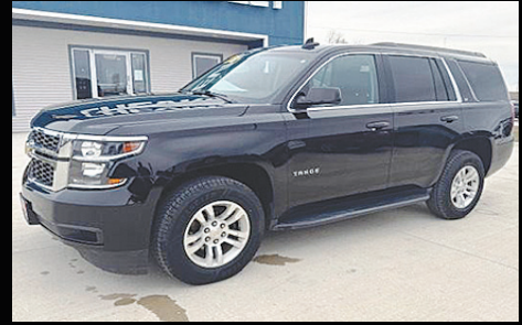
2017 Chevy Tahoe 4x4 LT, 89k, Htd Leather, DVD, Middle Bench, New Tires