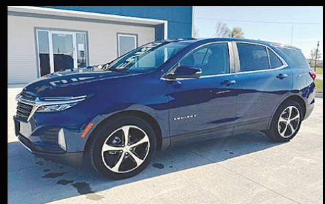
2022 Chevy Equinox AWD LT, 19k, Htd Cloth, Pwr Hatch, Remote Start