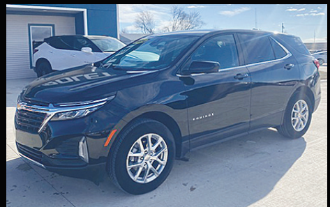
2024 Chevy Equinox AWD LT, 18k, Htd Cloth, Remote Start, Pwr Hatch