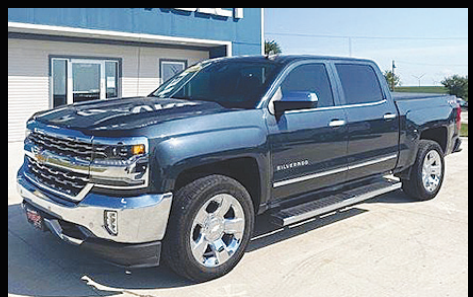
2018 Chevy Crew Cab 1/2 LTZ, 90k, Htd Leather, 20's, 1 Owner, Loaded