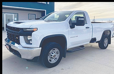
2020 Chevy Reg Cab 2500HD WT, 117k, 6.6L Gas, Keyless, 5th Wheel