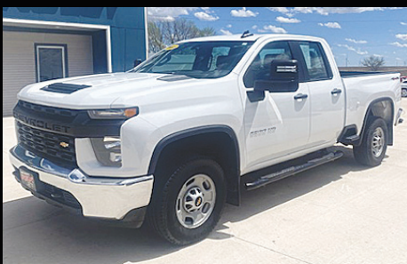
2022 Chevy 2500HD Dbl Cab WT, 27k, 6.6L Gas, Keyless