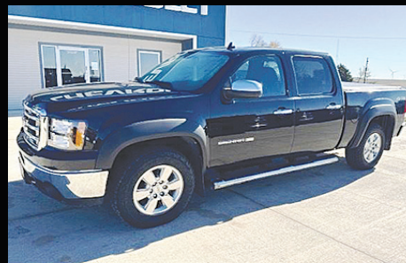
2011 GMC Crew Cab 1/2 4x4 SLE, 173k, Cloth Bench, New Tires, Chrm Whls