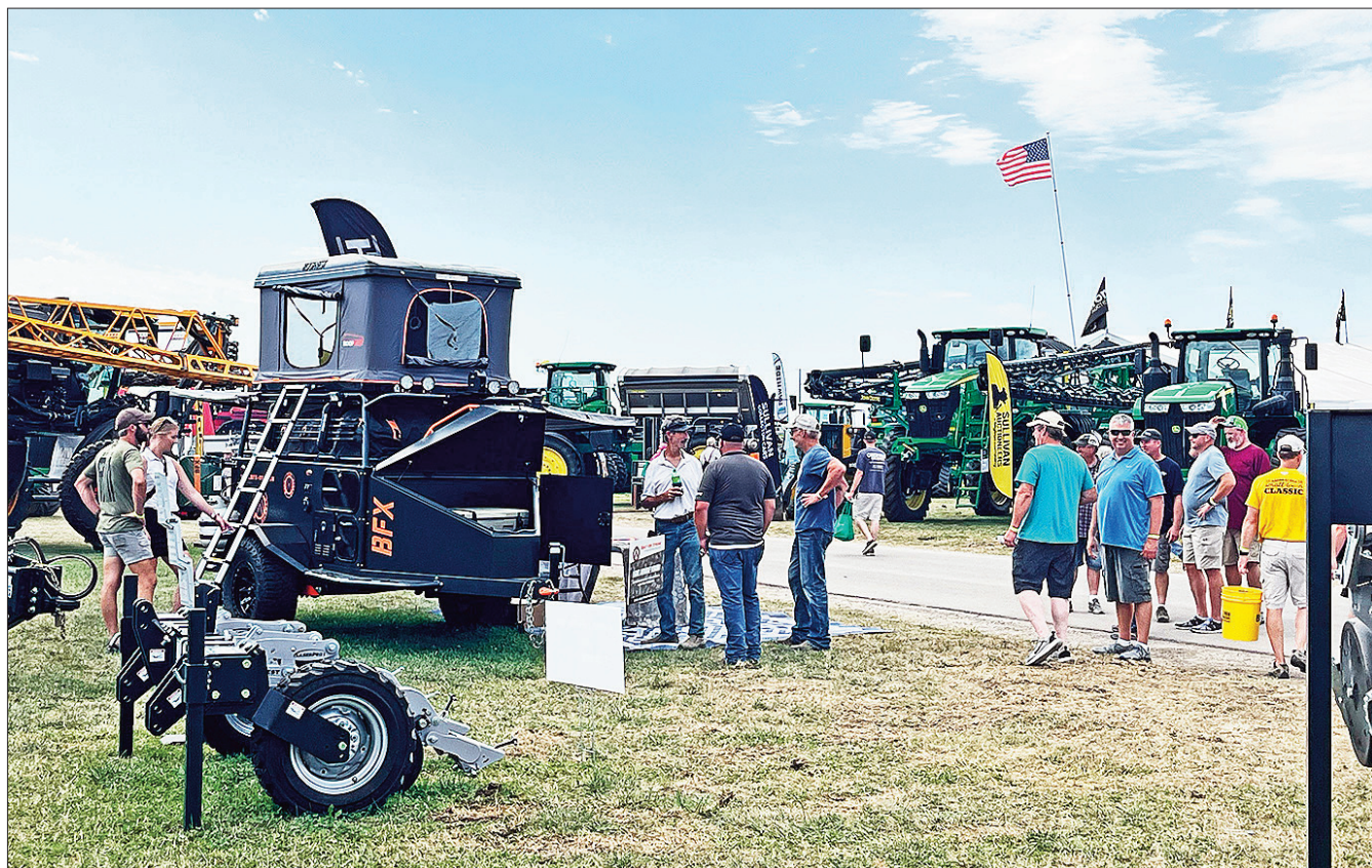
The BFX trailer on display at the Farm Progress Show in Boone this summer.