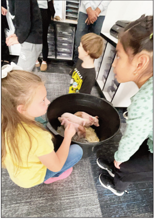
The BV Pork royalty brought adorable little piglets for the classroom to pet.