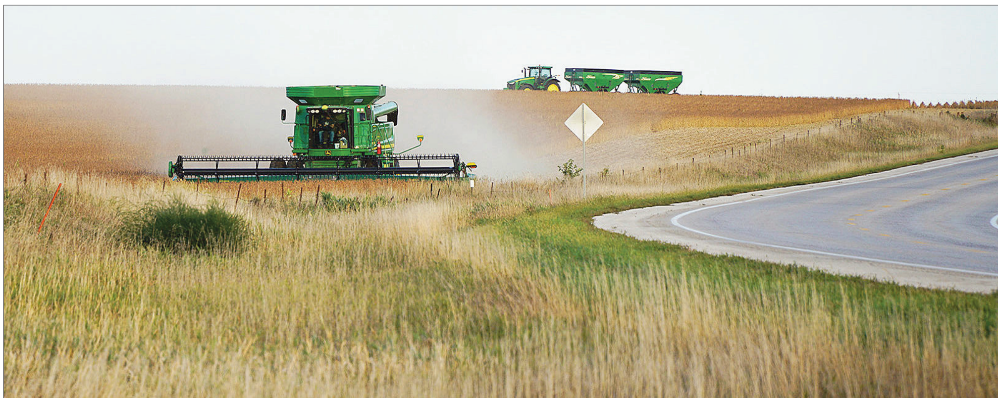
Combining beans near Aurelia.