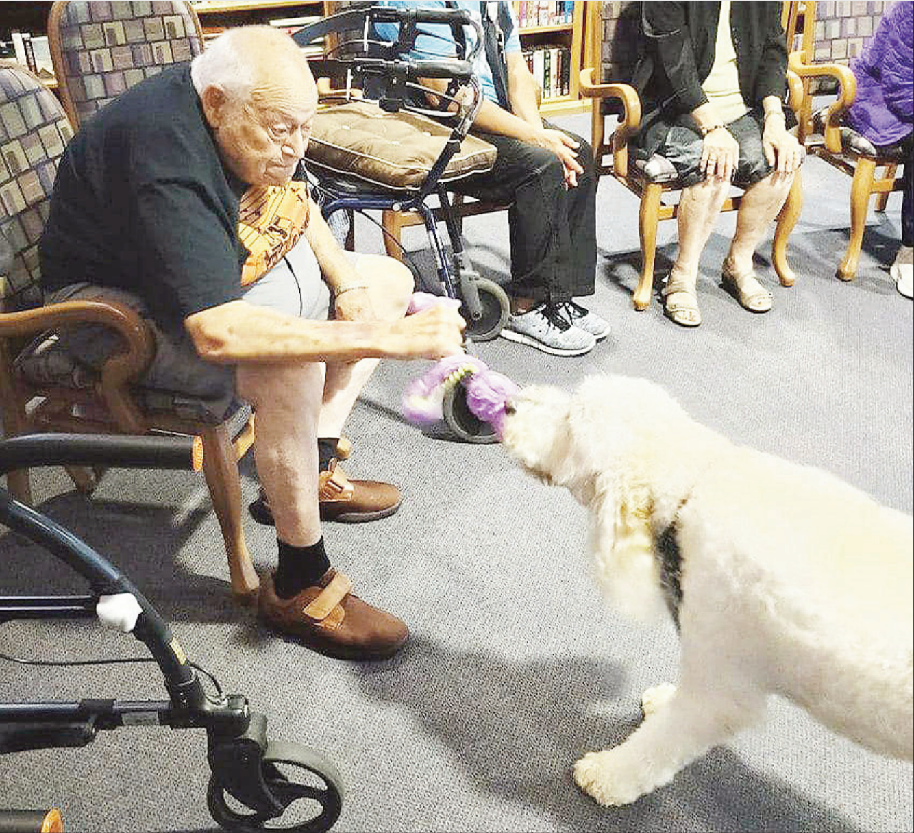
Fun with Milo the therapy dog.