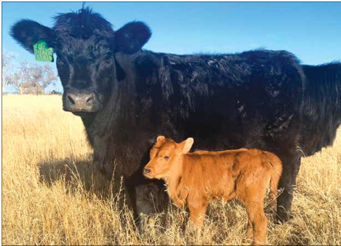
Calving season is here

This image shows an Angus cow and one of the first calves of 2024 born at Bray Ranches.