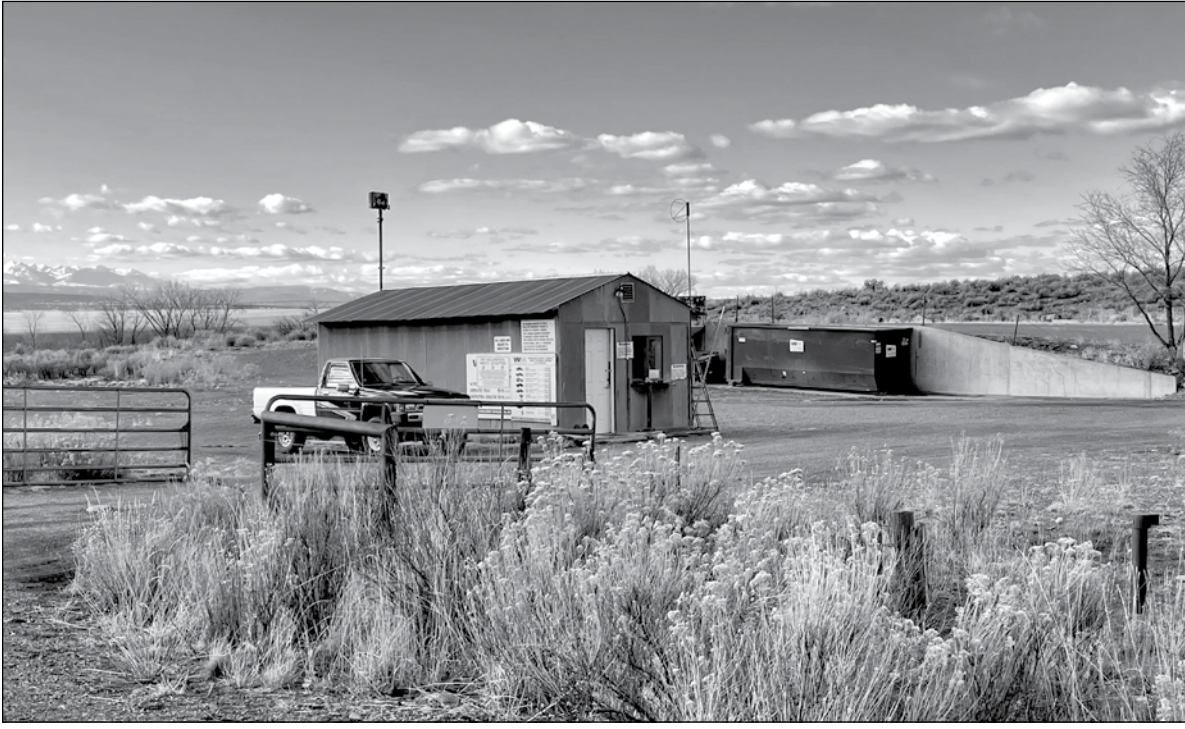
This image shows the Nucla Transfer Station, which will close at the end of February.