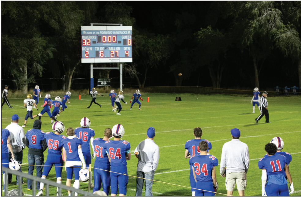
The Norwood-Nucla guys beat the pirates 36-8.