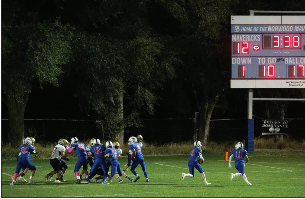
The combined Maverick team played Olathe last weekend.