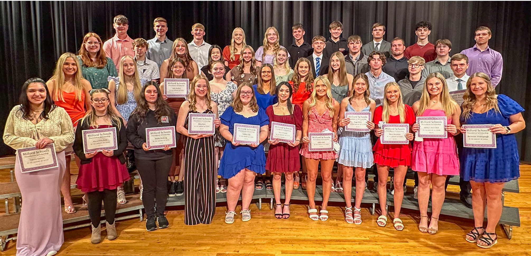
Milford High seniors received scholarships during honors night May 6.