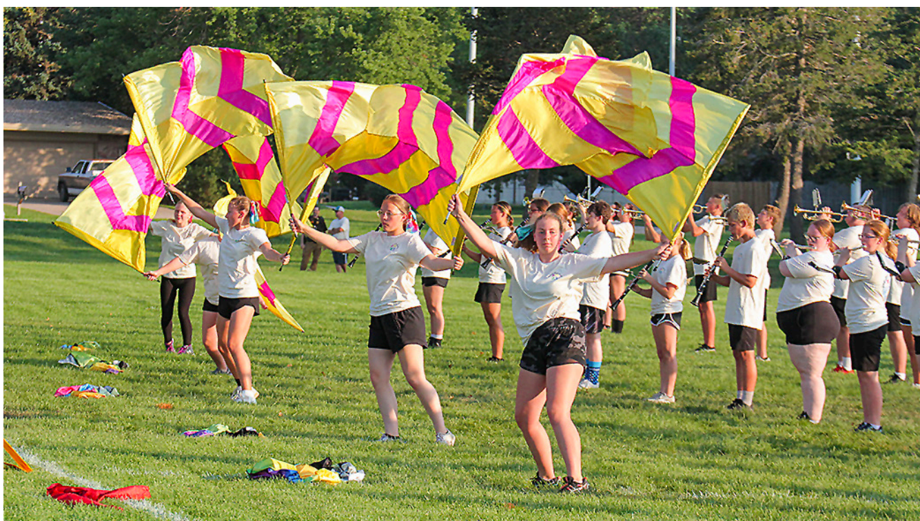
The Seward High marching band presented an exhibition of its 2023 show, Kaleidoscope, Aug. 4 to culminate its week of band camp. The band performed at halftime of SHS's home football games and competed in marching competitions.