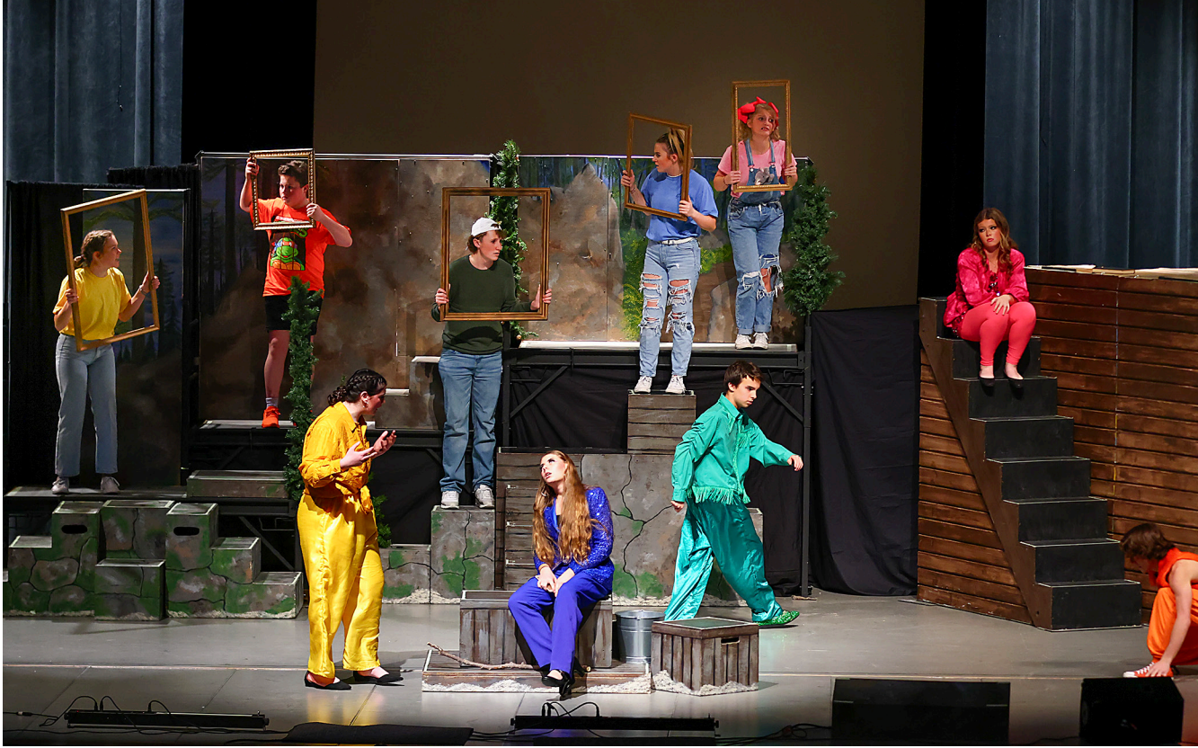
Malcolm High School's one-act play "'Five Children and It'" was the Class A state runner-up.