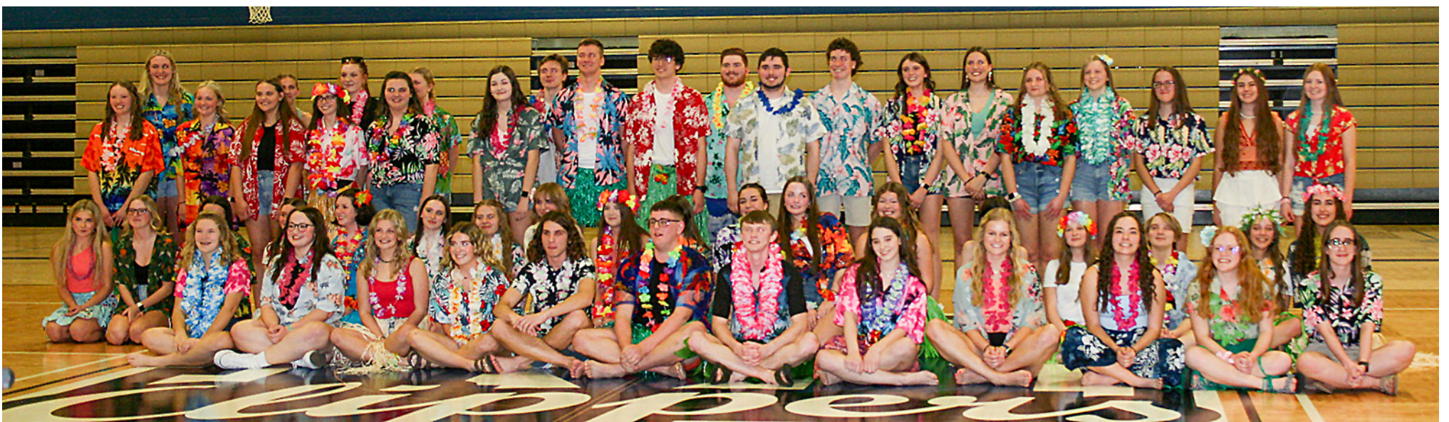
The entire Malcolm High choir also performs as its show choir.