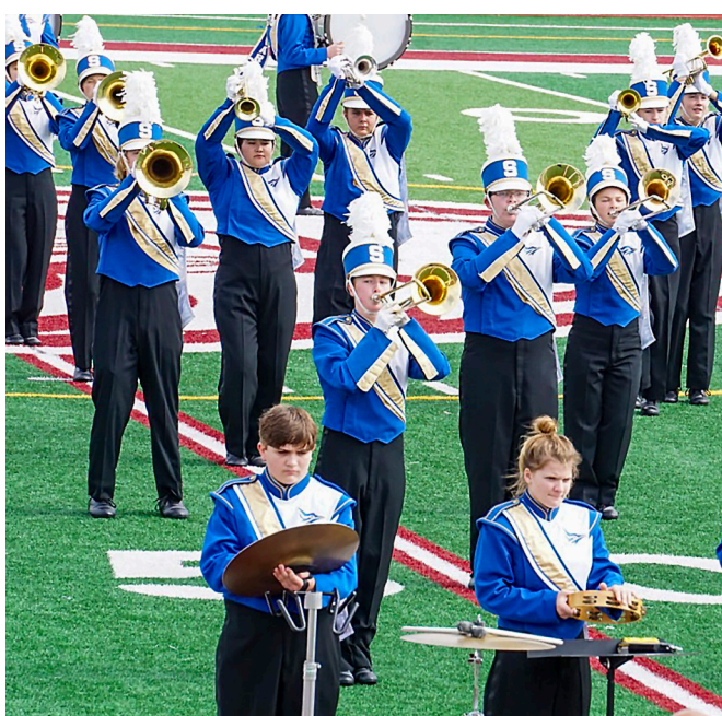
The Seward High band performs at Waverly during a marching competition Sept. 23.