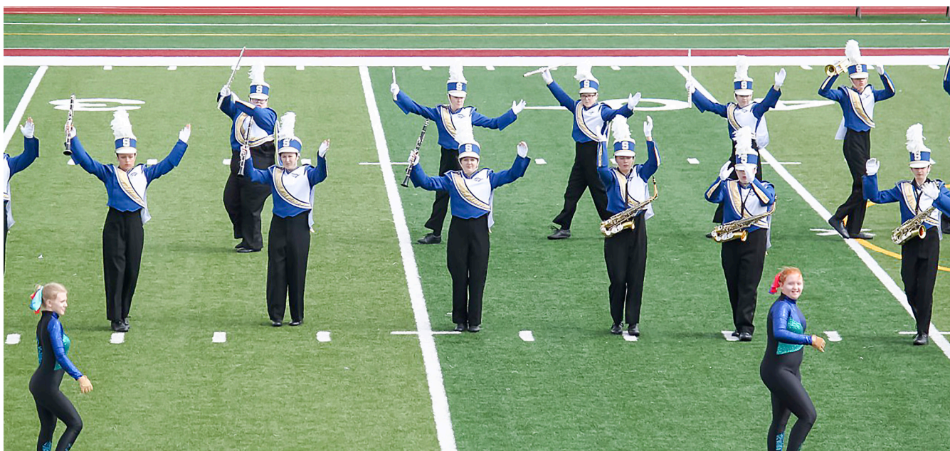
Members of the Seward High band encourage audience participation during 99 Red Balloons, part of the band's 2023 marching show.