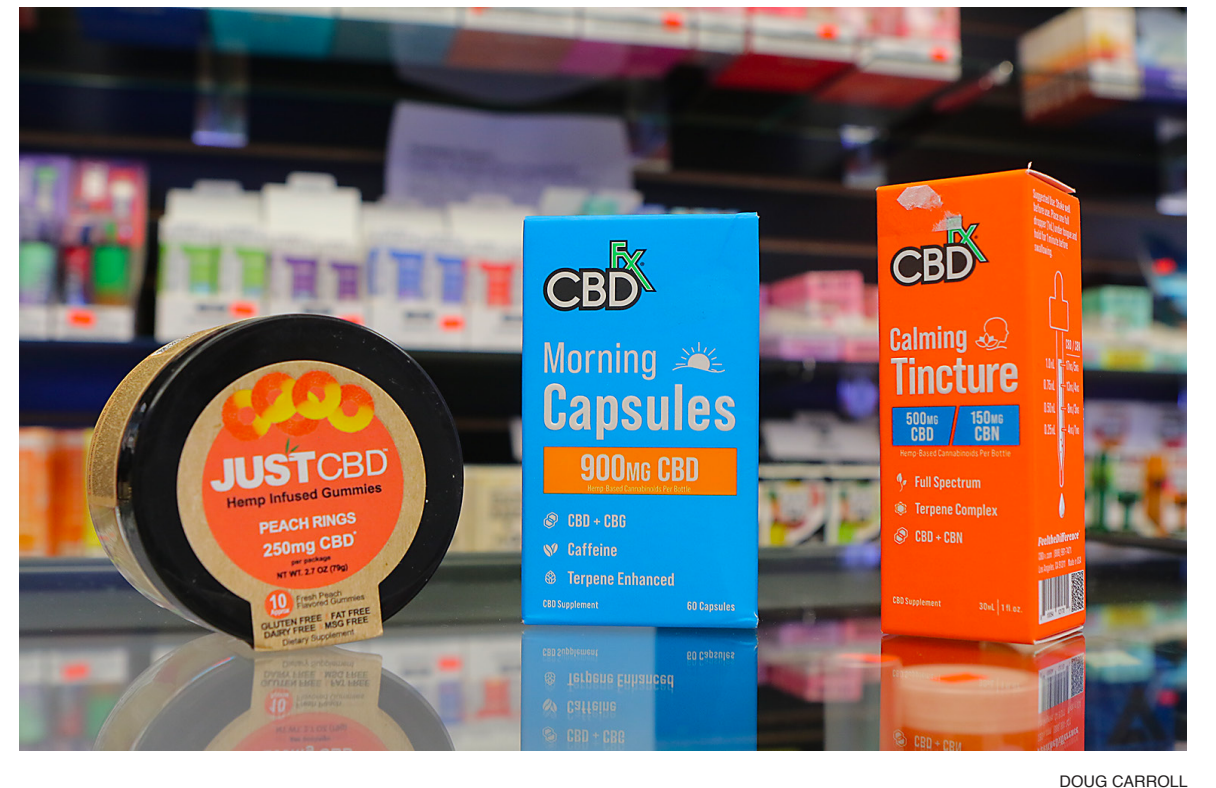
Smoke shops offering CBD products are located in both Crete and Seward. CBD may appear on a drug test.

"It's not a regulated item, so you don't have the protections of the FDA going out and testing these products