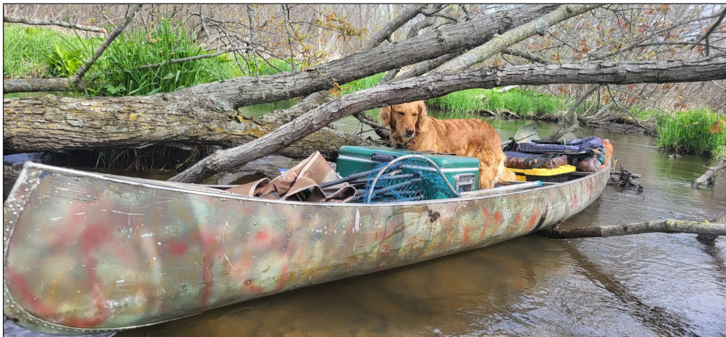
This was a no man's land type of a trip.

Hello friends, Last May, I headed down to Columbia County, put my canoe into the Wisconsin River and did a physical and at times dangerous journey for 90 minutes to a stream. Up that stream I fished trout and slept on the shoreline. I only had three bites in 24 hours, but I landed two 17-inch and a 22-inch brown trout. It was pretty much impossible for me to not return this May.