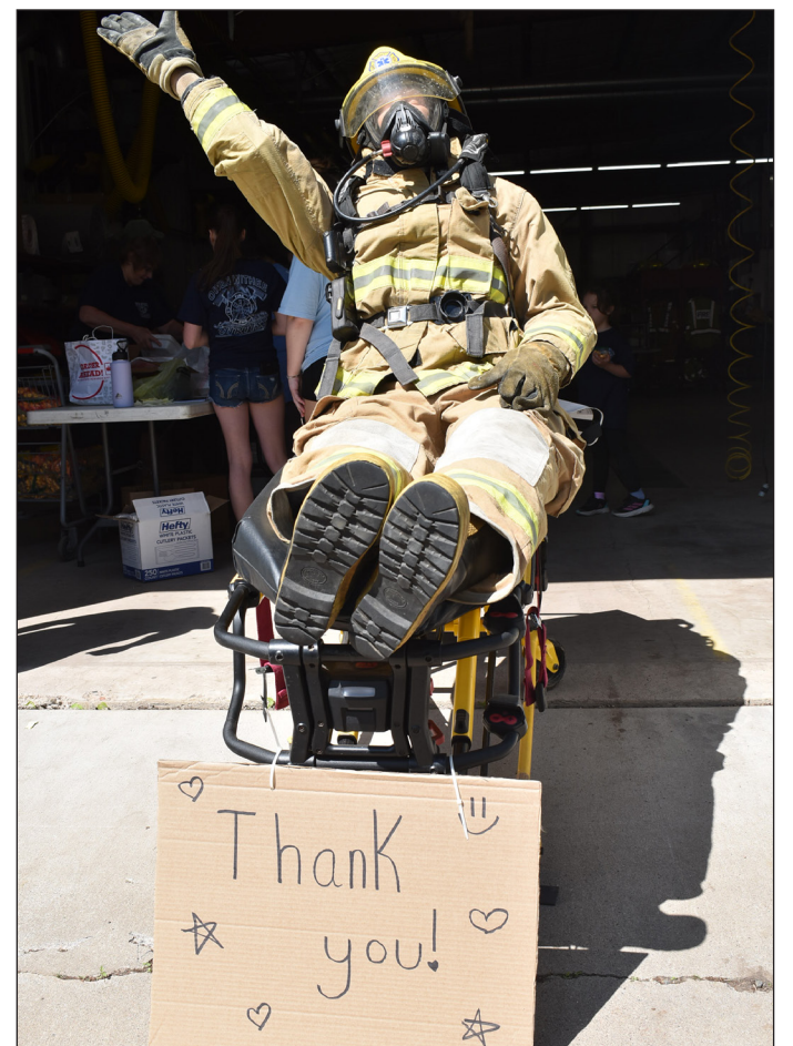
A unique way to say thank-you.

Wisconsin began the practice in 1957 after a statewide referendum.