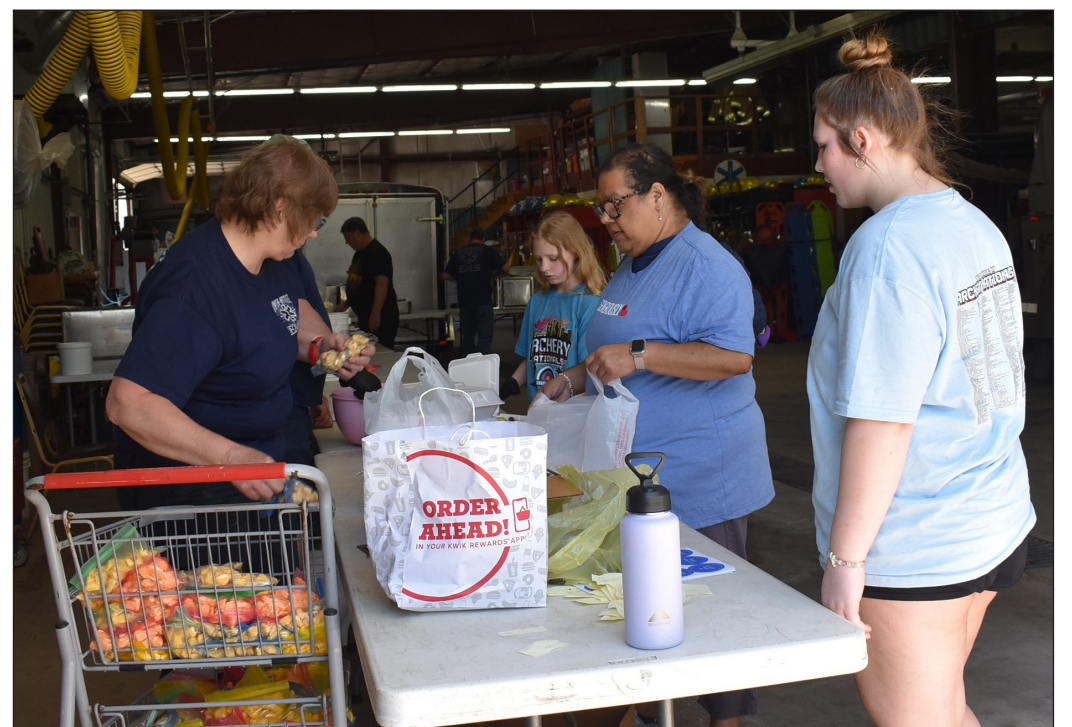
Packing up chicken dinners for the drive-through customers.