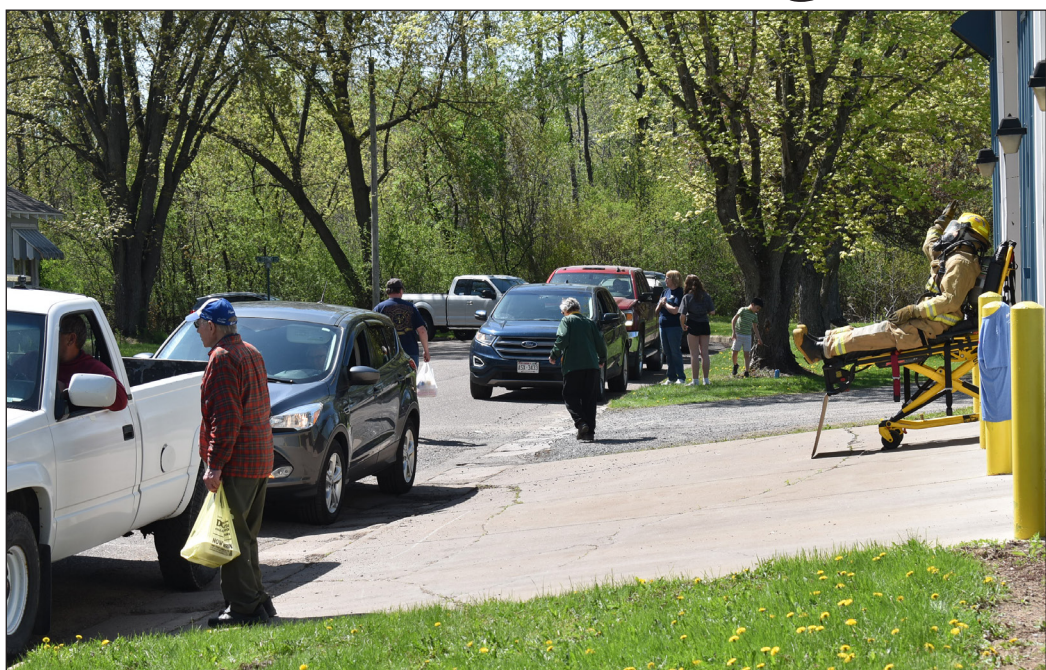
The street outside the fire hall was a busy place during the Owen-Withee-Curtiss Fire & EMS District Mother's Day Chicken Dinner on May 11. They sold out early.