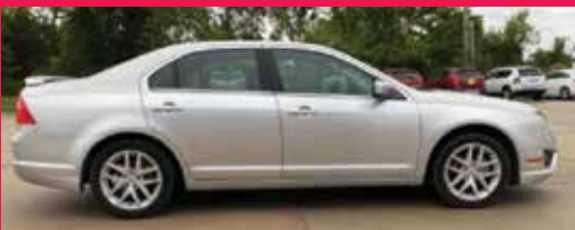
2012 FORD FUSION FWD, 4 Cyl., Silver