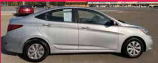
2016 HYUNDAI ACCENT FWD, 4 Cyl., Silver