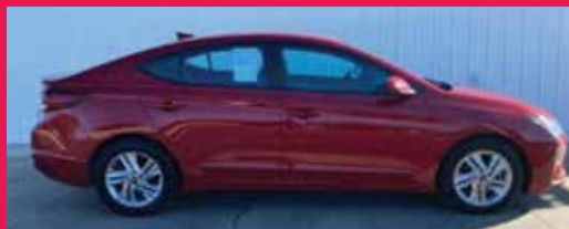
2020 HYUNDAI ELANTRA FWD, 4 CYL., RED