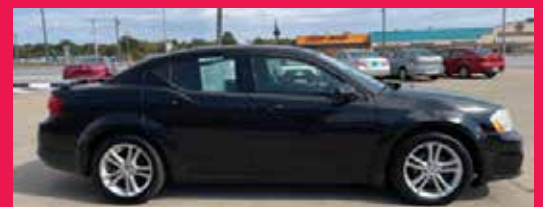
2012 DODGE AVENGER FWD, 4 Cyl., Black