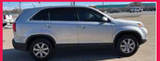
2013 KIA SORENTO FWD, 4 Cyl., Silver