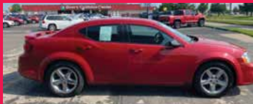
2013 DODGE AVENGER FWD, 4 CYL., RED