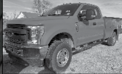
2017 Ford F350 XL, 6.2L, 65K Miles, Red. $36,500

Gorin, Missouri Monday-Saturday 8am-6pm www.ramertrucksales.com HOME: 660.282.1002 CELL: 660.341.6140 "NO SUNDAY CALLS!"