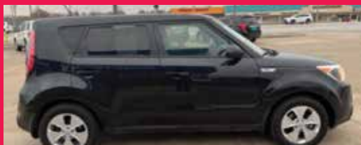
2016 KIA SOUL FWD, 4 Cyl., Black