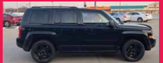
2015 JEEP PATRIOT SPORT FWD, 4 Cyl., Black