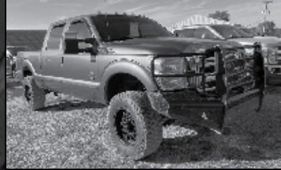
2012 Ford F250 Lariat, 6.7L, 180K Miles, Gray. $25,900