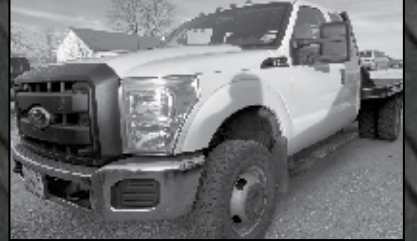
2011 Ford F350 XL, 6.2L, 4x4, 147K Miles, White. $14,900