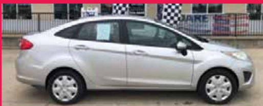
2013 FORD FIESTA FWD, 4 Cyl., Silver