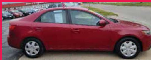
2013 KIA FORTE FWD, 4 Cyl., Red