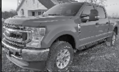
2020 Ford F350 STX, 7.3L, 30K Miles, Red. $45,900