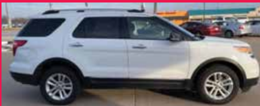
2013 FORD EXPLORER 4WD, 6 Cyl., White

660-956-4849 • 2015 North Baltimore • Kirksville