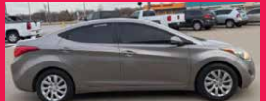
2011 HYUNDAI ELANTRA FWD, 4 Cyl., Gray