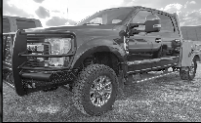
2017 Ford F250 XLT, 6.7L, 101K Miles, Blue. $37,500