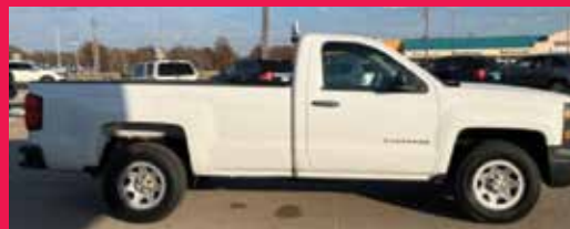
2014 CHEVROLET SILVERADO 1500 RWD, 6 Cyl., White