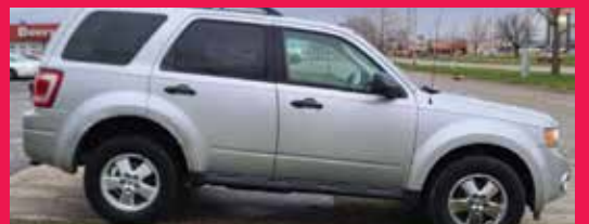
2011 FORD ESCAPE FWD, 6 Cyl., Silver