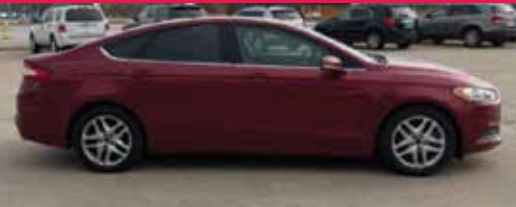
2015 FORD FUSION FWD, 4 Cyl., Red