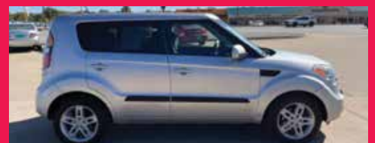
2011 KIA SOUL FWD, 4 Cyl., Silver