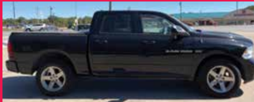
2012 RAM 1500 4WD, 8 Cyl., Black