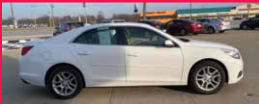
2013 CHEVY MALIBU FWD, 4 Cyl., Silver