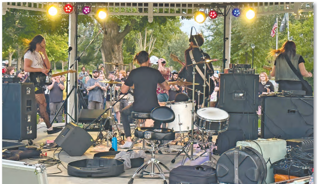
A Punk Show featuring Sunflo'er and friends will be presented in Potsdam's Ives Park gazebo 6 p.m. Saturday, Aug. 31.

In addition to running rotating exhibitions, an arts shop, community classes and workshops, as well as major programs including the North Country Arts Festival, Ives Park Concert Series, and the annual Artists' Studio Tour, SLC Arts receives funds from NYSCA and administers a competitive regrant program, making $160,000 available to artists and organizations annually throughout St. Lawrence, Jefferson, and Lewis counties for arts programming.