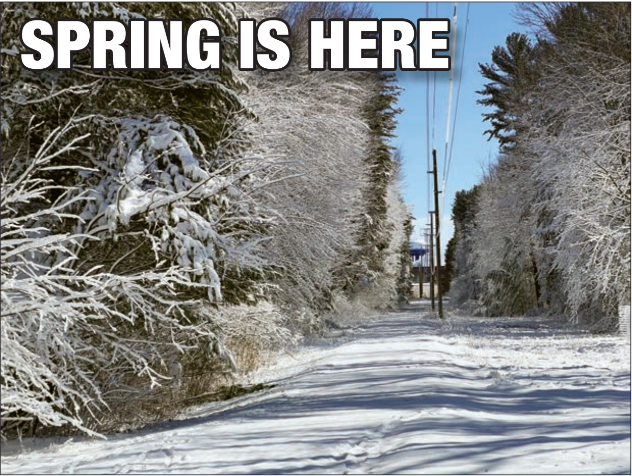
The first day of spring on March 20 in Stevens Point was rung in with five to seven inches of snow blanketed across the city. Pictured here, the Westside Loop of the Green Circle Trail was covered in heavy wet snow that weighed down tree limbs that nearly touched the ground in some areas.