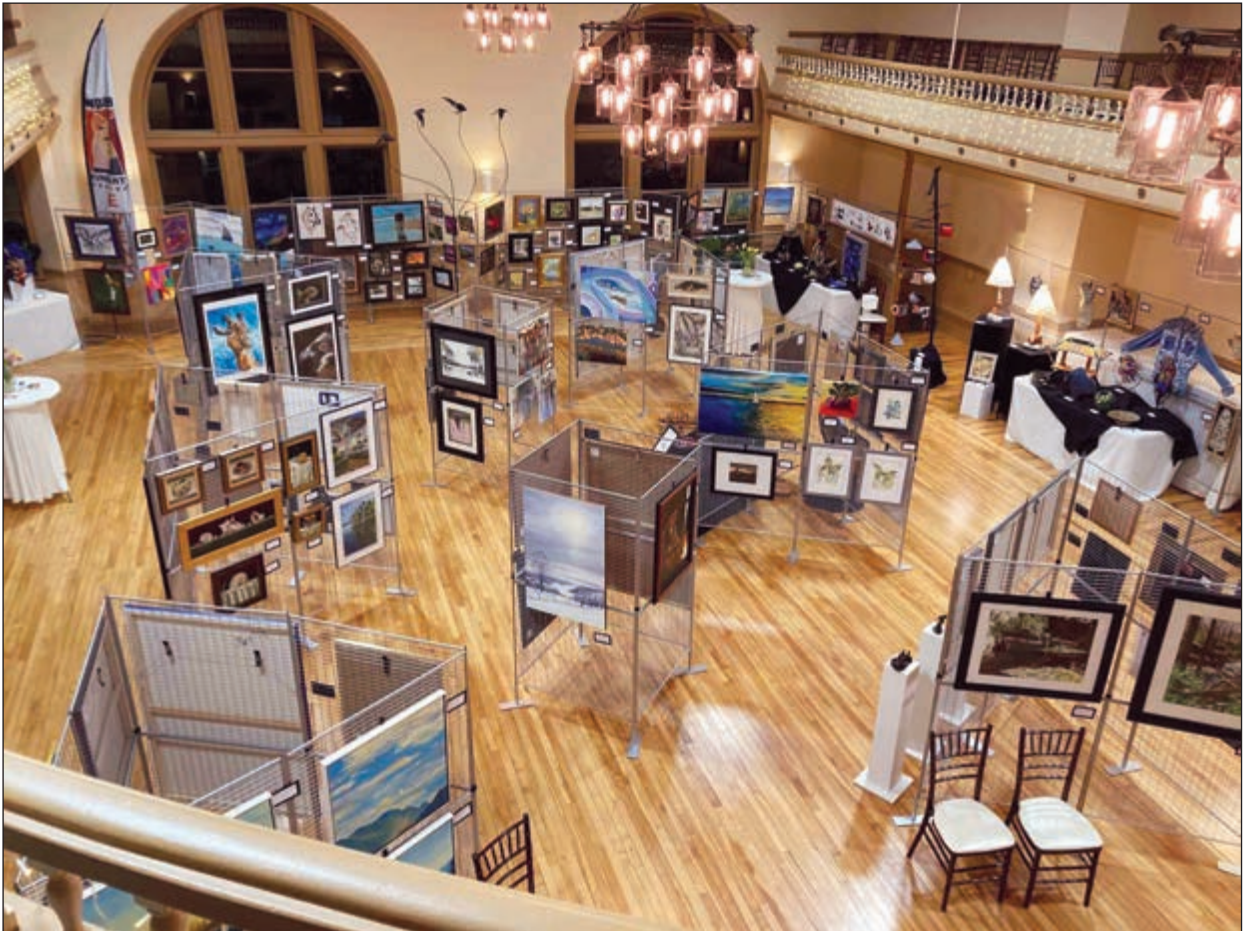
A view from the loft at Danes Hall at the 2024 Waupaca Arts Show, this year the show will take place April 12-16 at Danes Hall.