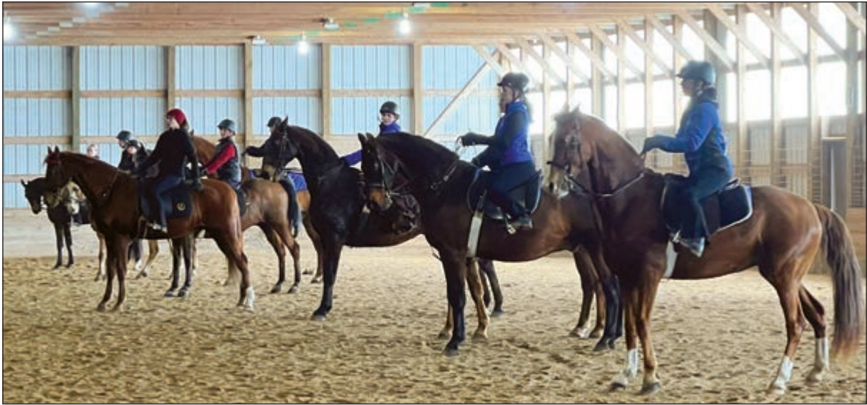
Riders at the Heartland Equestrian Center competed in various classes. These shows are open to the public and free to watch. The next one in Custer is April 19.