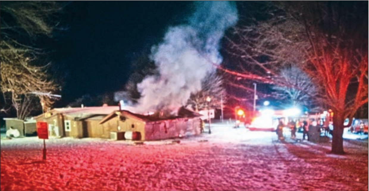
The New London, Manawa, Weyauwega, Waupaca, and Fremont Fire Departments were dispatched to a structure fire at E7294 Guth Road at 10:12 p.m. Monday, March, 24. The fire caused substantial damage to Guth’s Resort. The fire is under investigation.