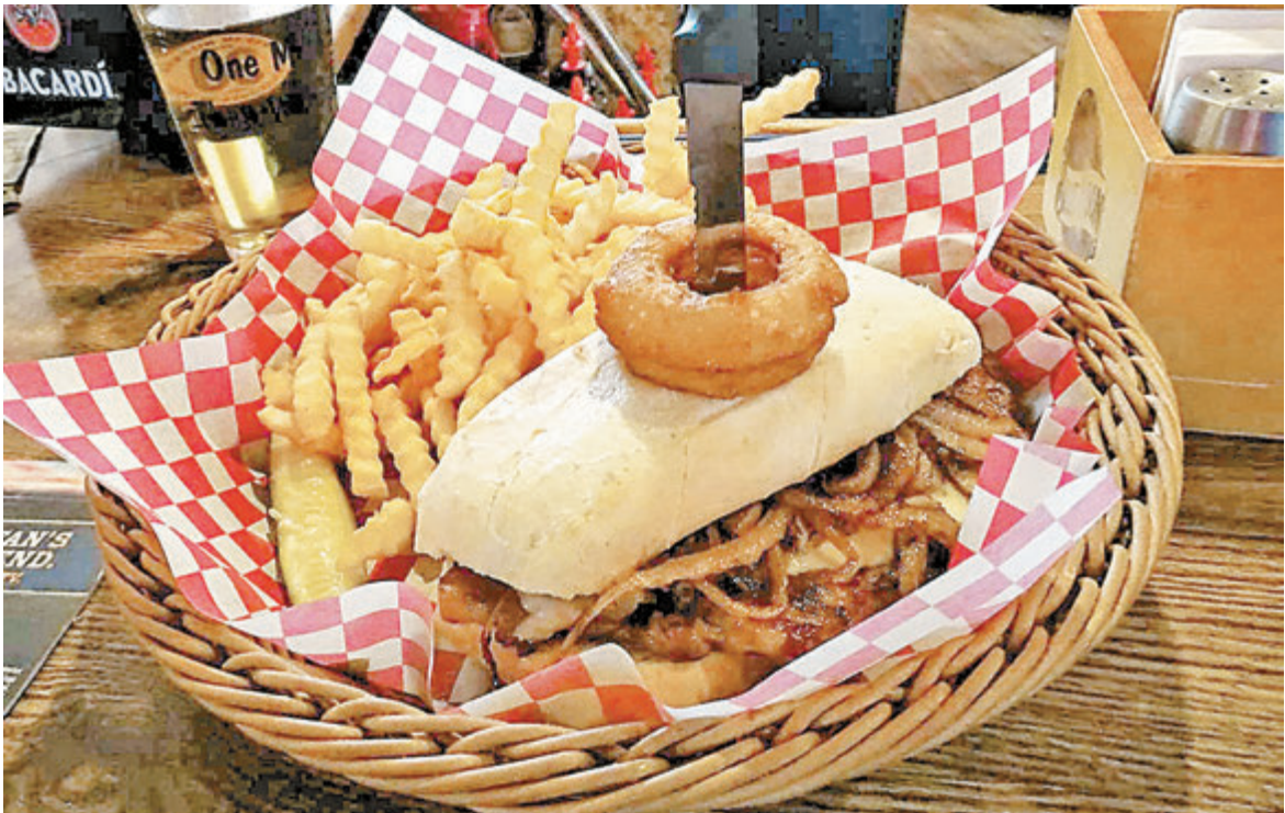
The Ribeye steak sandwich has returned to The Timbers menu everyday. Cooked-to-order it comes with your choice of mushrooms, onions, cheese and topped with two onion rings alongside a generous portion of french fries.