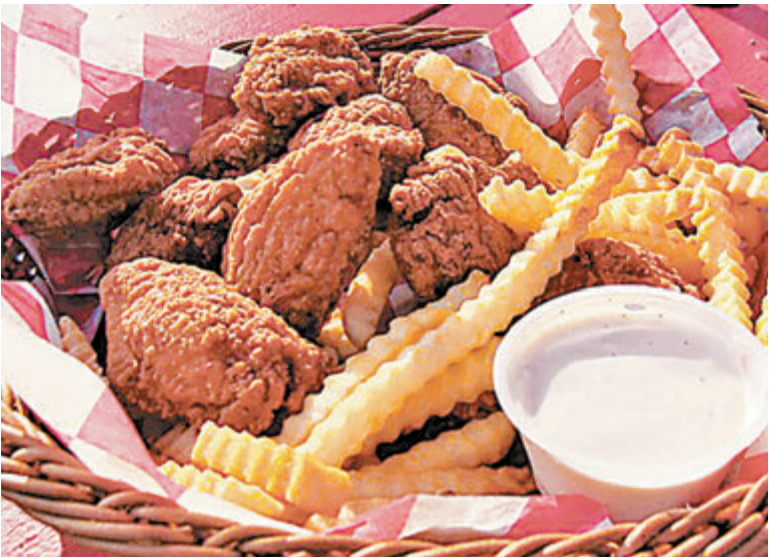
Wing Wednesday is a popular event weekly at Timbers Bar & Grill in Saint Germain. Ten wings and fries served for $10.

Friday is for fish fry as Timbers offers their three-piece breaded haddock alongside French fries, coleslaw and rye bread. A shrimp dinner is also available and served with a choice of seasoned lime rice or fries. A beer-battered shrimp basket is also available to go along with grilled shrimp skewers served with seasoned rice or fries.