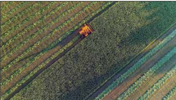
Agricultural harvesting at the last light of day, aerial view.

FOR CITY TIMES WISCONSIN RAPIDS – Mid-State Technical College will host the fourth annual Central Wisconsin Farm Profitability Expo on Wednesday, April 30, at the Wisconsin Rapids Campus from 10a.m. to 3p.m. The in-person expo is the result of a partnership with UW-Madison Extension, Wisconsin Potato Vegetable Growers Association, regional watershed groups, nonprofit organizations, Wood County Land and Water Conservation staff and agricultural and natural resource specialists. The Farm Profitability Expo is designed to encourage profitable farming by building resiliency, diversifying farming operations, reducing inputs and increasing a farmer's return on investment. Attendees will learn about best-management practices farmers can use to take advantage of what nature has to offer and increase self-sufficiency on the farm, such as regenerative management, managed grazing, cover and companion crops and no-till farming. They will also explore the specific barriers central Wisconsin farmers are experiencing when adopting best management practices through discussion with fellow farmers who have implemented these practices. This event is free to participants due to funding provided by Wood County Land and Water Conservation. Certified Crop Adviser's (CCA) credits will be offered to all attendees. Registration is required by Thursday, April 24. Learn more and register at mstc.edu/farm-expo .