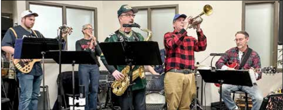
Hub City Jazz