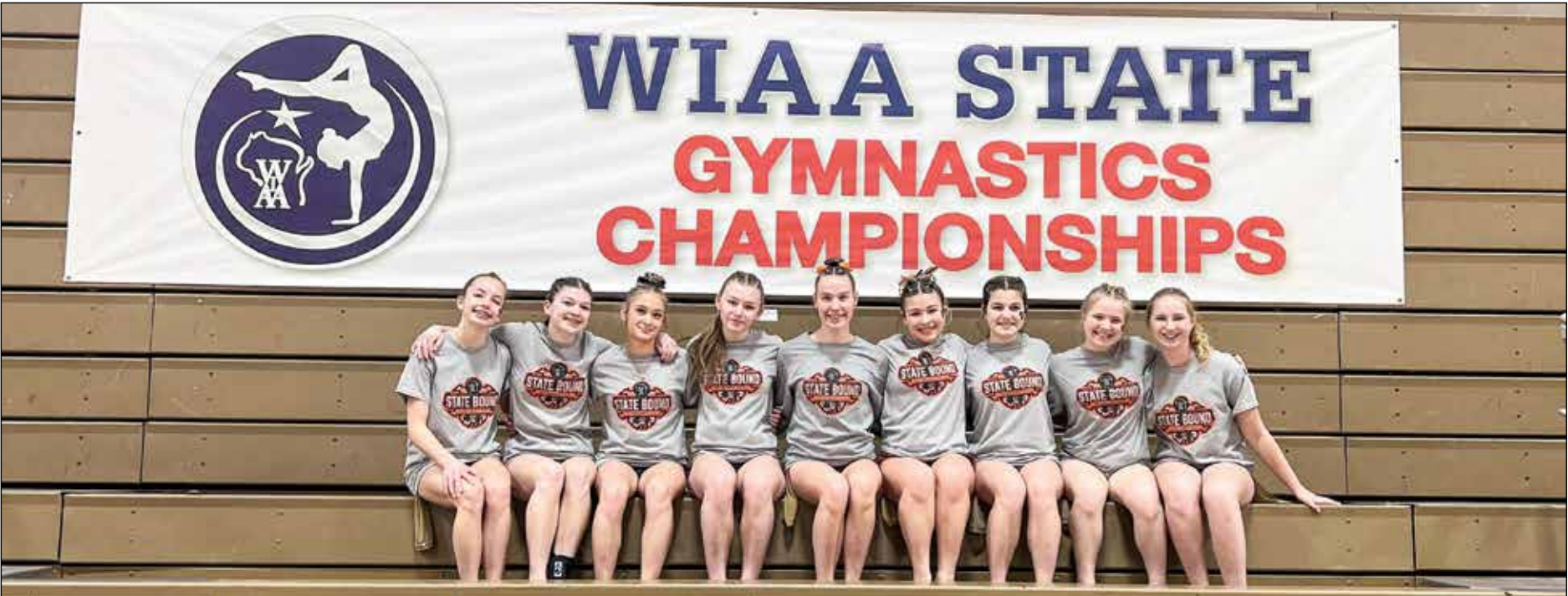
ABOVE: Marshfield's Girl's Gymnastics took 4th place as a team at the WIAA State Gymnastics Championships held on March 7 in Wisconsin Rapids.