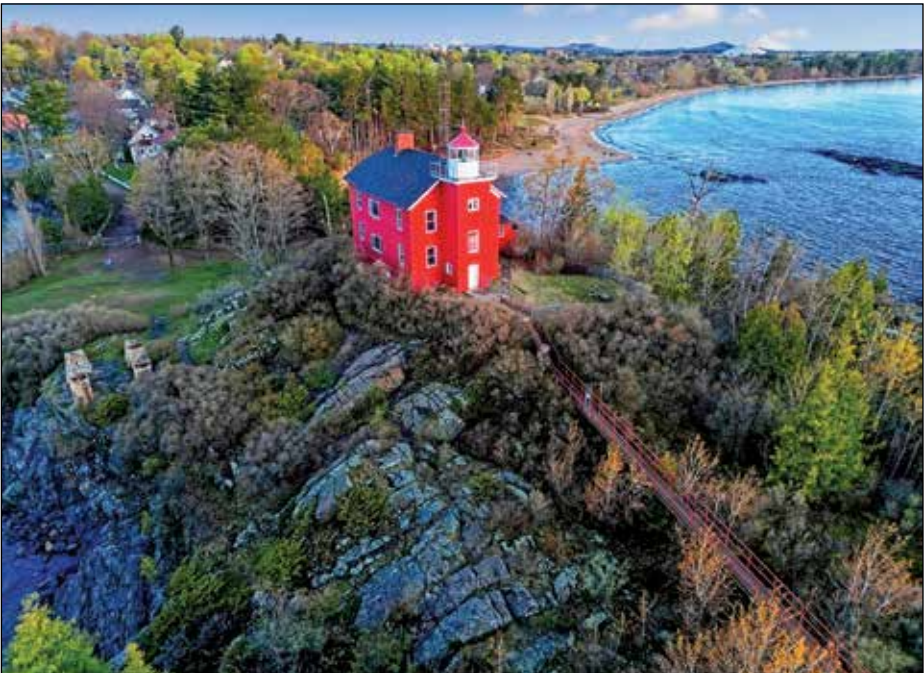
MARTY WELTER OF MARTIN PHOTOGRAPHY