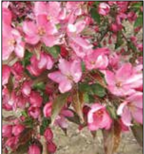
Pictured are Pink Sparkles Crab and Canadian Hemlock.

To Order: Contact Sue Winch - swinch9@gmail.com or the Parks Department: (715) 421-8240 / parksdepartment@wirapids.org 220 3rd Avenue South, Suite 3. Cash or check only, unless paying at Parks & Recreation Office. Payment is due at time of order. Please provide your email address and cell number at time of order to be informed of pickup details.