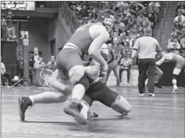
Warhawks had 10 wrestlers compete in the WIAA individual wrestling tournament.