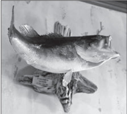
Little Wolf River Outfitters in downtown Manawa now offers taxidermy for fish, with the option of either a skin mount or replica.

He said he will be holding the same fishing contest he held last year, which challenges kids to catch all 12 species of fish found in the Little Wolf River.