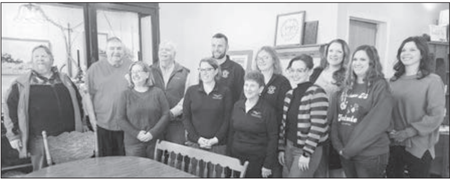
Members of the organizations that received grant funds from the Clintonville Area Foundation gathered at The Living Room Coffee Shop & Vintage Decor in Clintonville in February for the grant distribution event.