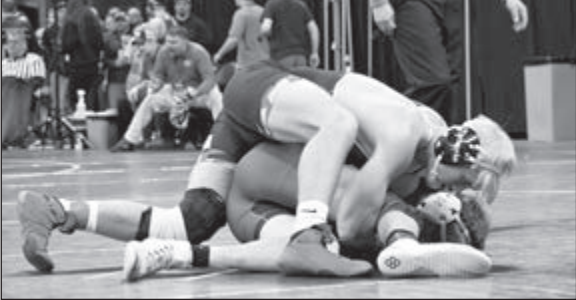
The Weyauwega-Fremont Warhawks wrestling team finishes their season in second place at state.