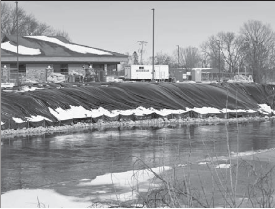
The shore stabilization project recently wrapped up in Manawa as the city prepares for the spring thaw.

For more information on taxidermy or upcoming fishing events you can find Little Wolf River Outfitters is located in downtown Manawa. Email Zemple at lwriveroutfitters@gmail.com, call them at 920-596-2002 or find them on Facebook at Little Wolf River Outfitters.