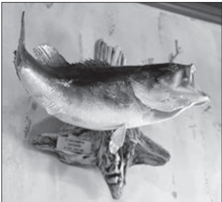
Little Wolf River Outfitters in downtown Manawa now offers taxidermy for fish, with the option of either a skin mount or replica.

He said he will be holding the same fishing contest he held last year, which challenges kids to catch all 12 species of fish found in the Little Wolf River.