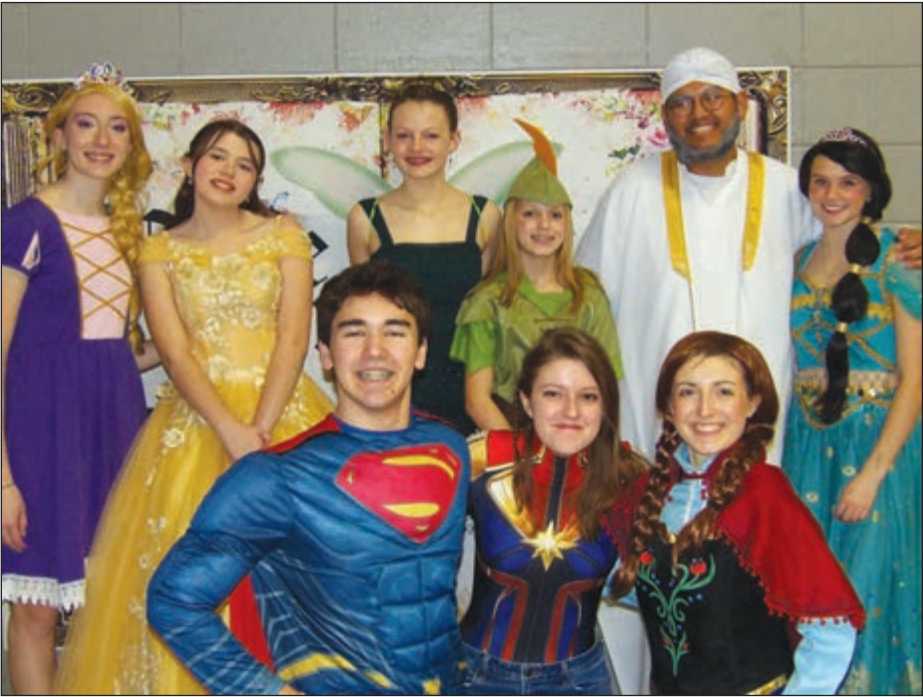
The biggest event of the year at Pacelli Catholic High School is their annual Princess and Superhero Party. The school’s Drama Club is a key organizer of the event.

varying roles within Monogram Foods selects recipients and amounts of the grants ranging from $500 to $10,000. In 2024, 126 grants were given out. The deadline for applications is May 30, 2025. Applicants will be notified of the status of the application via email by Sept. 15, 2025.