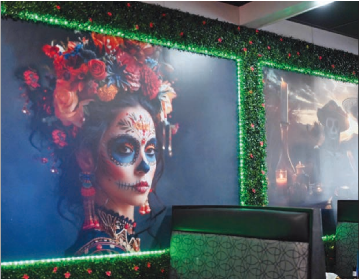
Murals hung in Mexico Grill and Bar serve to really bring home that authentic Mexican vibe.