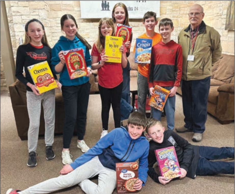
Students at St. Paul Lutheran School collected a total of 923 boxes of cereal to support a local food pantry.

STEVENS POINT – Starting on Friday, March 7, the Portage County Highway Department will be imposing seasonal weight restrictions on various county trunk highways. The weight restrictions are six tons gross load for single axle and ten tons gross load for each tandem axle (any two axles under eight feet apart). The maximum gross vehicle weight is 26 tons. Portage County Highway Department will begin installing signs along all posted roads beginning at 7:00 a.m. Enforcement will begin when signs are installed. Seasonal weight restrictions are enforced annually in the spring during the time that the frost is coming out of the ground. This is necessary to protect the pavement which is susceptible to damage by heavy loads during this time of year. Permits to exceed these limits may be granted based on the policy adopted by the Portage County Highway Committee. These weight restrictions are for county trunk highways only. Any weight restrictions on state, city, village, or town roads are handled by each individual entity.