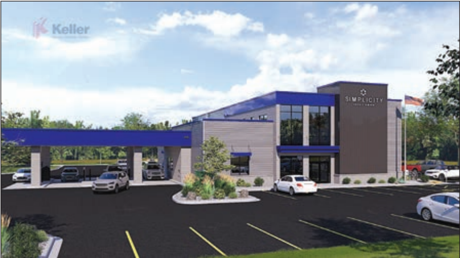
A rendering by Keller of what the new Stevens Point branch of Simplicity Credit Union will look like. Ground breaking will start in April. Submitted Image