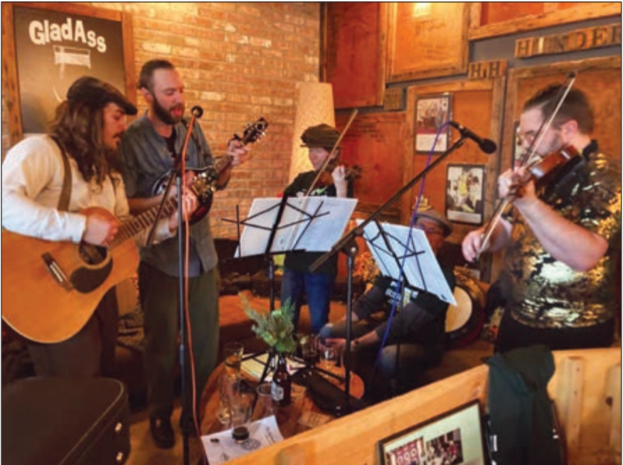
Musicians jam a Celtic ballad at HH Hinder. The brewery will host the 25th Irish Wake on Saturday, March 15.