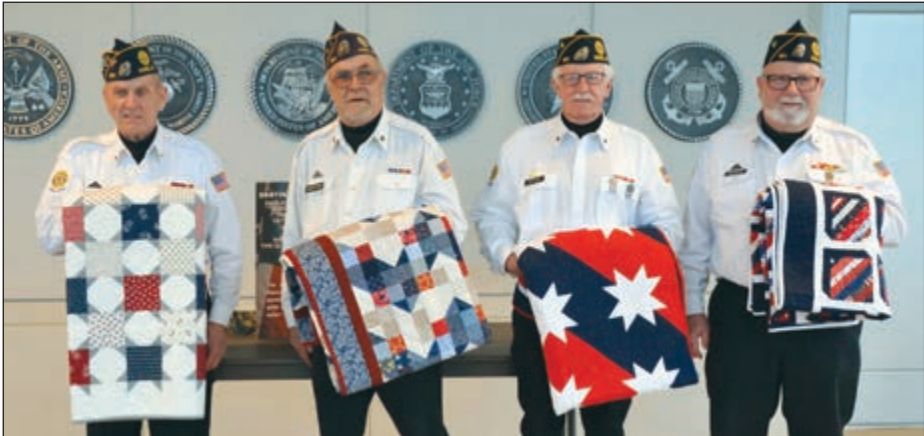
The Darting Needles Quilt Guild presented four Quilts of Valor to four members of the American Legion in King on Feb. 26.