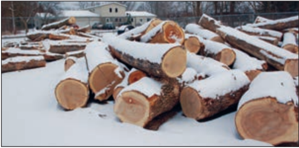
The City of New London will liquidate an abundance of ash timber via bids as it removes tress killed by emerald ash borer beetles.