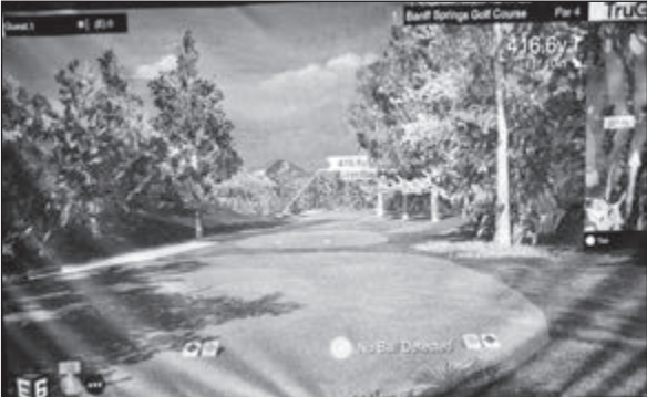
Golfers can play over 100 computer-simulated courses at Fremont Indoor Golf located in the Fremont River Deck.

Four golf simulators are available to rent by the hour. There is no limit on the number of golfers at each bay; hence, a small group of golfers can replicate the camaraderie of playing a few rounds together. Also the Fremont River Deck’s