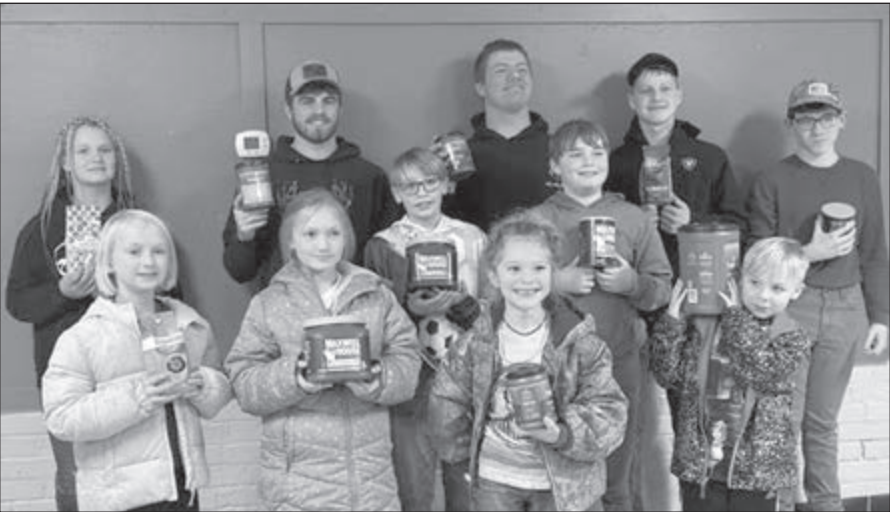
The Lind Center Beavers 4-H Club held a coffee drive for the veterans at Wisconsin Veterans Home in King.

Residents and businesses should visit spectrumruralexansion.com to learn more about when their home or business may be able to receive Spectrum services.