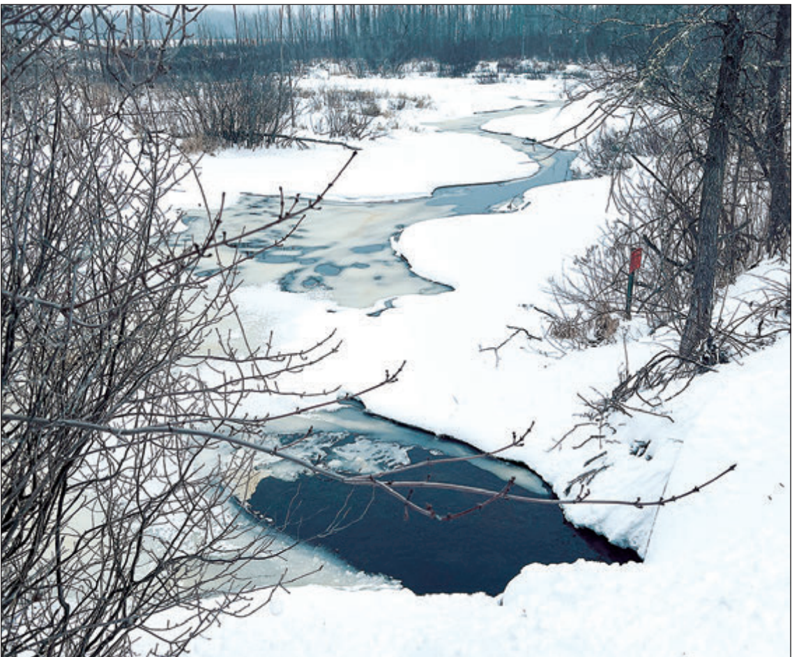
SOME CREEKS OPEN — Snow and ice covered portions of Rainbow Creek that runs between Tamarack Lake and Birch Lake in northwest Vilas County. Sections of the creek remain open due to the mild winter that included temperatures in the mid-30s on Sunday when this photo was taken.

Winchester representative for NEMSD. Using paid staff, this new system is available 24 hours a day and has already saved lives by getting help out the door rapidly to answer the calls of the injured or sick. “Recognizing that many of our calls involve serious medical issues, we set a goal of bringing a higher level of care to the people we serve,” Herzberg explained. The district moved from a basic life support (BLS) system with EMT responders, which is often used by volunteer services, to an advanced life support (ALS) system with paramedic responders. “Our response patterns show that we are achieving our goals. In more than 90% of our cases, we are getting