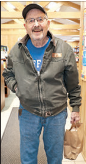
A happy Library member leaves with a bag of books.