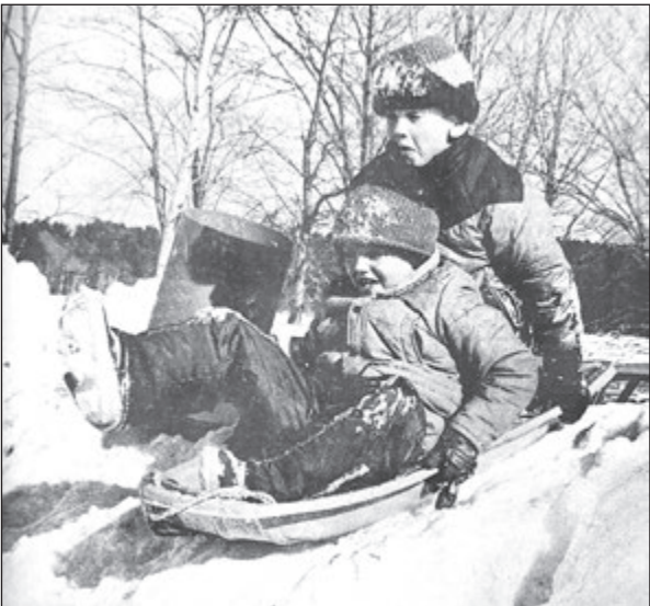
HERE WE GO, 1985 — If facial expressions could tell the whole story, it would appear these two youngsters were headed for trouble as they sledded down a small embankment in Cy Williams Park during the Three Lakes Lions Club's Fishing Jamboree Sunday.