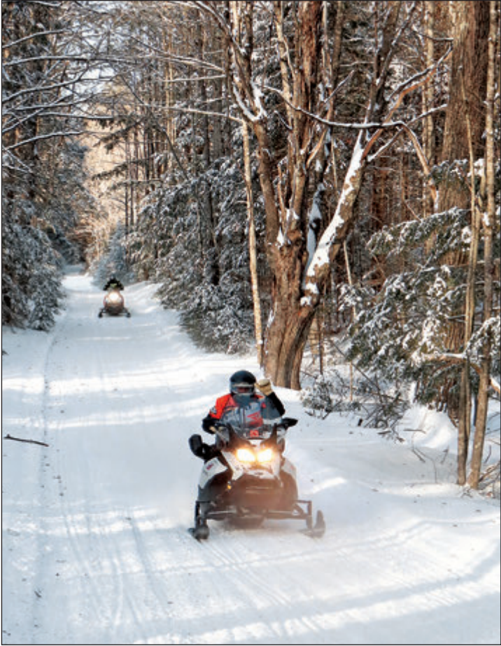
Trails in Oneida County opened last Friday morning, and more snow will be needed to further improve upon already “fair” conditions.