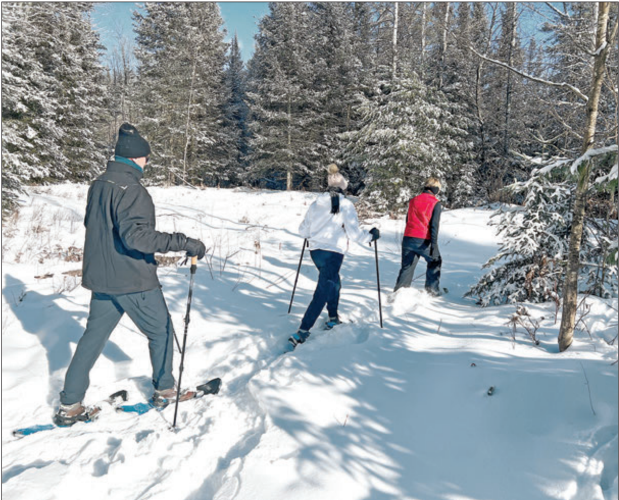
WINTER WONDERLAND—With 4-5 inches of new snow Saturday, the landscape was perfect for a snowshoe outing under sunny skies in the North Woods Sunday afternoon.

To the Editor; Behind every Veteran's story is a lifetime of courage, sacrifice and service — a legacy that deserves our deepest gratitude. As we celebrate National Salute to Veteran Patients Week, I invite our community to join us in recognizing and supporting the Veterans in our lives. As the Administrator for Compassus Hospice in Arbor Vitae and Rhinelander, I've had the