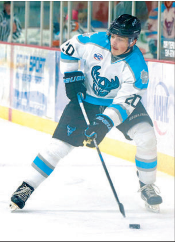
The Wisconsin Windigo remain in first place of the Midwest Division of the North American Hockey League after a sweep of the Janesville Jets this past weekend in Eagle River.