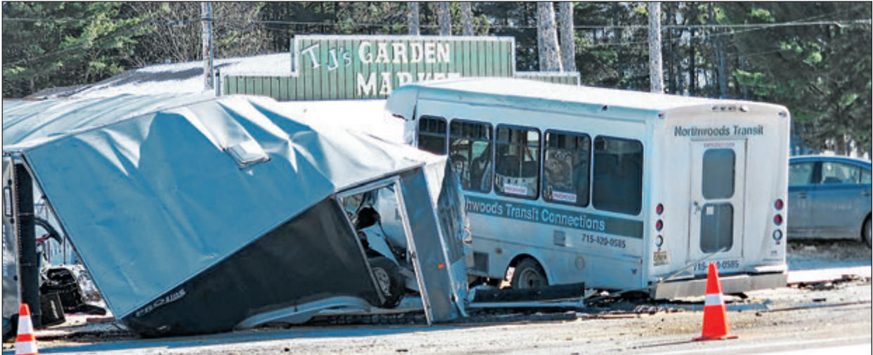
This Northwoods Transit Connections bus came to a rest in front of a retail store after colliding with a snowmobile trailer being pulled by a pickup truck in Minocqua Friday afternoon.

a list of the required documents that are needed to present at a DMV Customer Service Center in order to obtain identification to show at the polls at wisconsindmv.gov/idcards . A process is available to U.S. citizens, free of charge, to obtain a receipt valid to take to the polls for voting if the ID card is not available in time. DMV offers this service and ID cards for voting purposes free of charge. DMV's toll-free hotline (844) 588-1069 is available for questions on obtaining an ID that can be used to vote. DMV's website has a locator to help find the nearest DMV and check wait times at wisconsindmv.gov/centers .