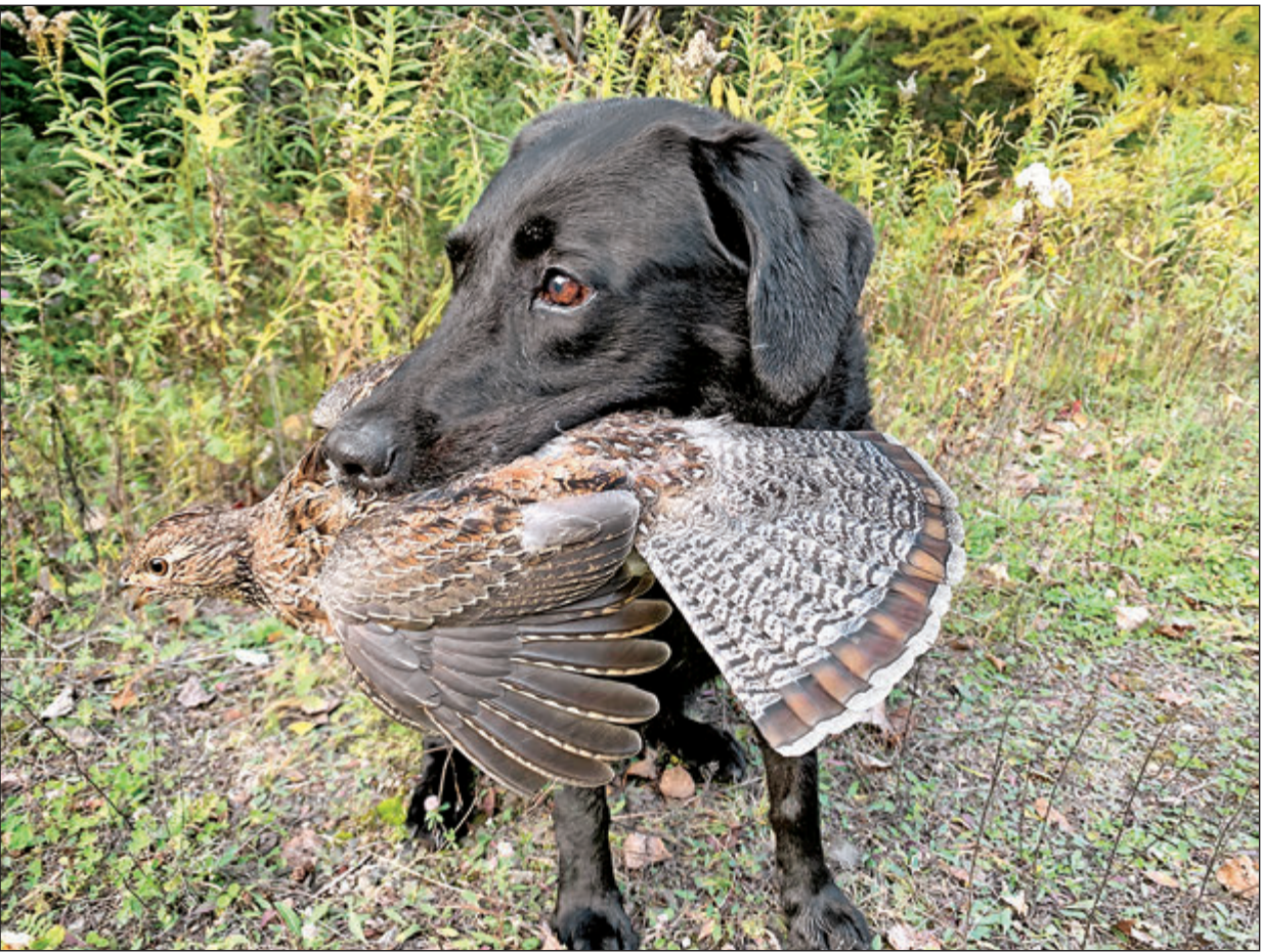
Hunters who want their crippled birds coming back alive, and in good shape for the dinner table, might want to consider putting their retrievers “on the table” to teach them the hold command.

every day for a couple of weeks has a lasting impact on a dog, and the word “hold” becomes magic for teaching a dog to lightly hold anything you want it to — birds included, whether dead or alive.