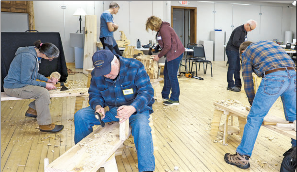
Participants carving their own wooden bowls.