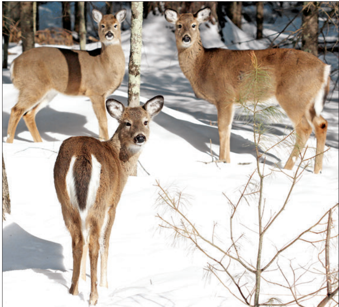
HEALTHY HERD — It’s been a relatively mild winter for wildlife like these white-tail deer despite some cold snaps of below-zero temperatures. Local deer are maintaining a hardy winter coat and foraging enough food to stay healthy.