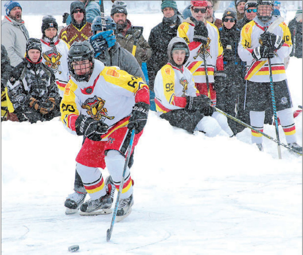
POND HOCKEY — After its cancellation for the 2024 season, Dollar Lake got to see some pond hockey action with the 2025 Pond Hockey Championships this past weekend. Players and spectators alike descended upon Eagle River as games were played Friday through Sunday, with divisions for both men’s and women’s players.