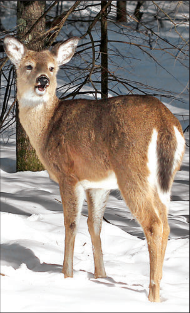
FIRST-YEAR DEER — This fawn is still traveling with its mom in order to gain strength and experience. Thanks to what has been a pretty mild season with low snowfall levels, young deer are having no problems surviving their first winter.