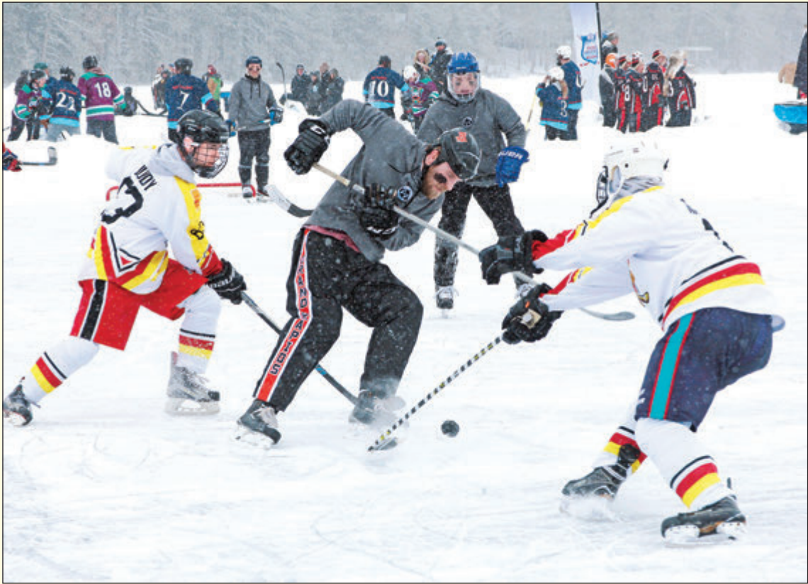
SHOW DOWN — Eagle River saw the return of the 2025 Pond Hockey National Championships last weekend. Over the course of 350 games spanning across 20 rinks crafted atop the frozen surface of Dollar Lake, over 200 teams from across 14 states showed down for the title of pond hockey champion.