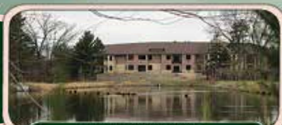
Arborcreek Apartments 1410 2 Mile Avenue, Wisconsin Rapids