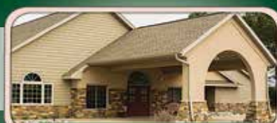
Whispering Pines • 715-342-4445 3380 Bridlewood Drive, Plover