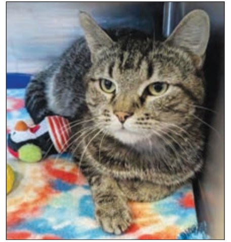
2 STAGES OF BELLY RUBS