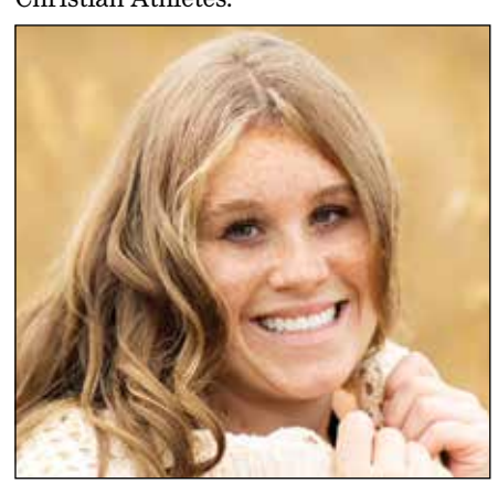
letter of recommendation "she leads by example... plays

a crucial role on athletic teams...and excels academically". A second letter of recommendation states "Her maturity is beyond her years." Her hobbies include volleyball, softball, water sports, shopping & spending time with family.