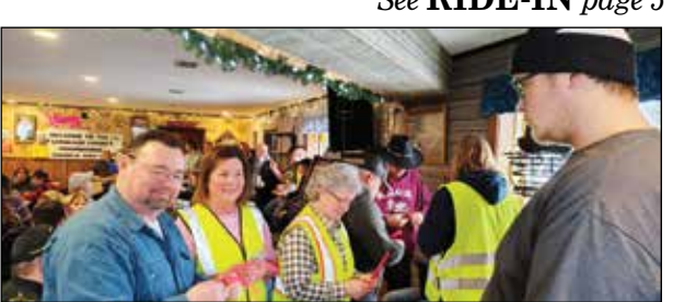
Some of our other volunteers that helped throughout the day.