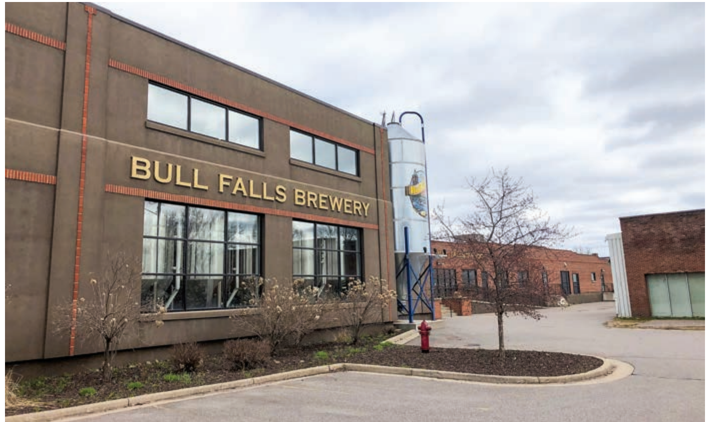
The new owners of Bull Falls Brewery tell City Pages they plan to reopen under the same name possibly as soon as mid-March

According to the foreclosure judgement order, Bull Falls Brewery's previous owners took out a loan for roughly $1 million and owed $1.15 million at the time of the decision last fall.