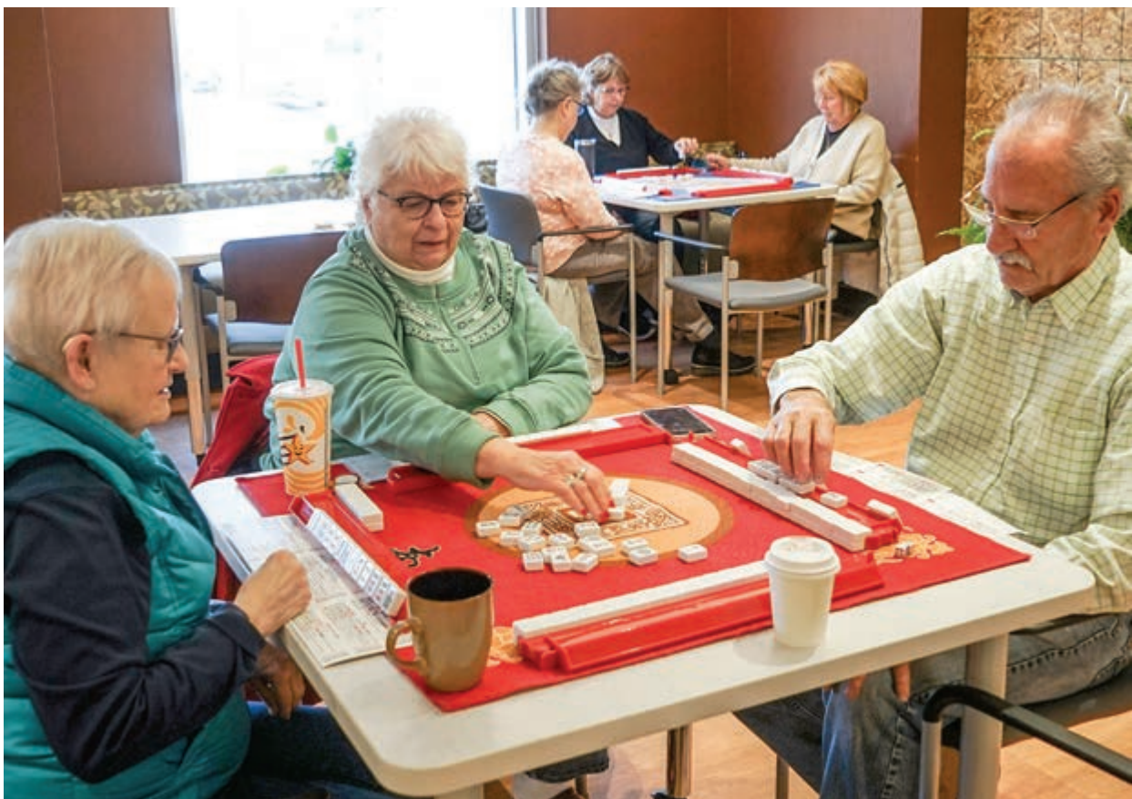
Seniors play Mahjong at The Landing on a Friday afternoon.

Why the programs? The senior population in Marathon County and Wisconsin as a whole is growing. According to a report from the state Department of Health Services, between 1.5-4% of Marathon County's population is 60 and older. And Marathon County's population of residents 70 and over is expected to grow by 70% between 2020-2040, according to analytics firm Forward Analytics.