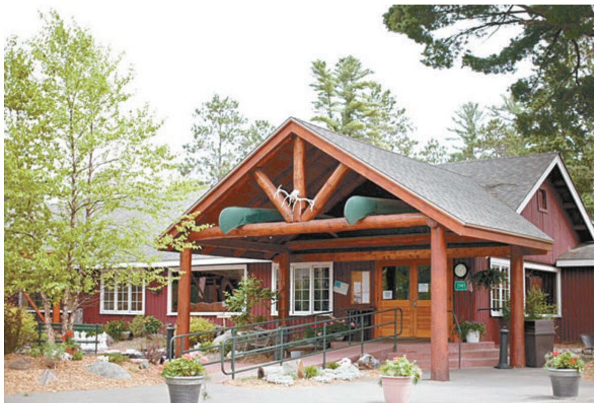
Eagle Waters Resort Restaurant is open Wednesday thru Saturday from 5 - 9 p.m., with the bar available starting at 4:30 p.m.