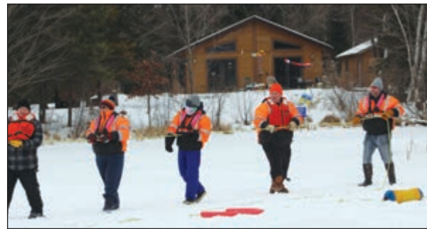
The group then headed onto the ice on Lake Killarney to put their training into action.

“The training at Little Rice comes at a critical time, ensuring local fire departments are ready to