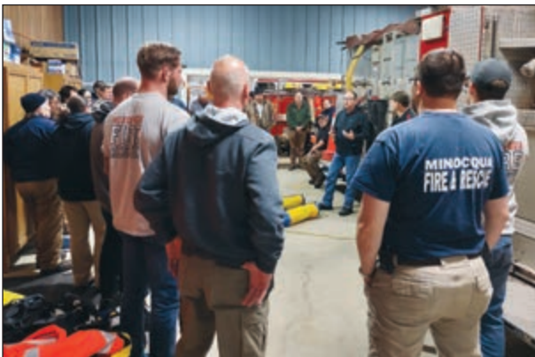
The day began with a three-hour classroom session at the Little Rice Fire Department.