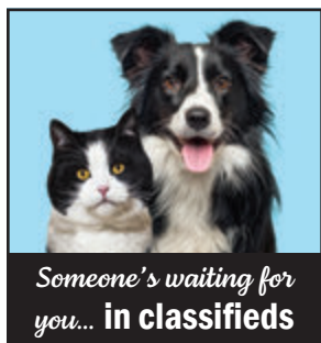
Someone's waiting for you... in classifieds