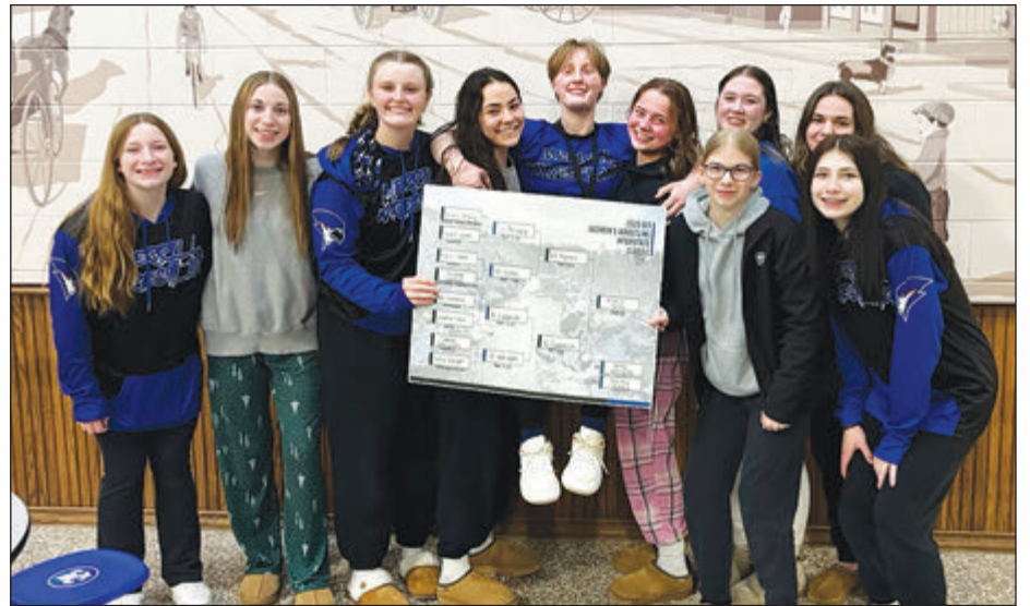
The Merrill Girls Varsity Wrestling Team celebrates taking third place as a TEAM in a bracketed tournament with 30 teams.