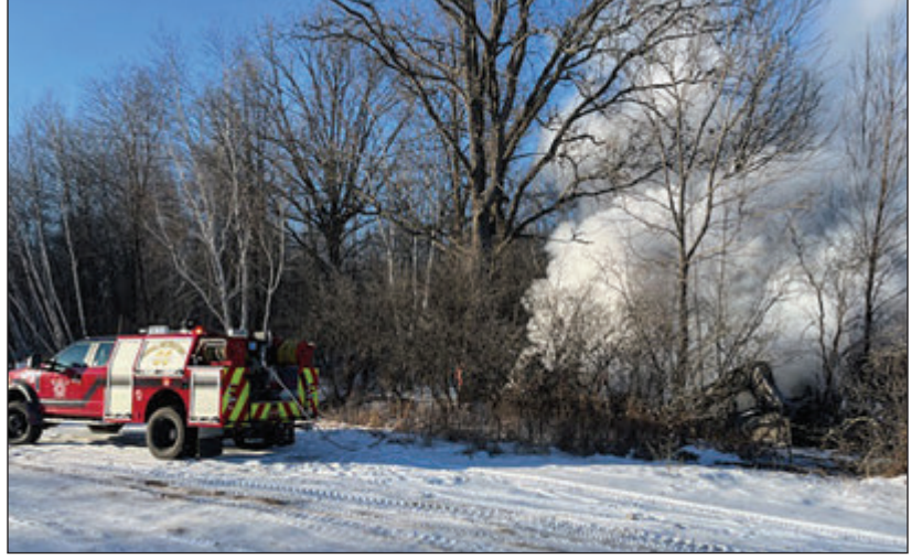
The Merrill Fire Department and DNR were called to a suspected grass/brush fire which turned out to be a camper in a lightly wooded area.

On Tuesday, Jan. 21, 2025, just before 3 p.m., the Merrill Fire Department (MFD) and Merrill DNR Ranger were dispatched to a possible grass or brush fire due to the report of black smoke coming from a field north of Tri-Hi Transportation on Hwy. 107 northwest of Merrill in the Town of Merrill. According to a press release from the MFD, Brush-66, Enigne-61, and Med-61 responded immediately but quickly determined it was not a grass or brush fire, but "a large camper that was burning and was already mostly consumed by fire."