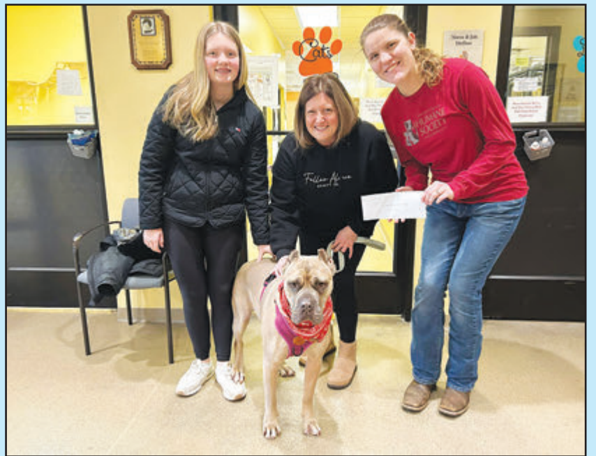
Fallon Aliche Beauty Co. recently held a fundraiser in honor of Zena, a dog they adopted from the Lincoln County Humane Society last May. They presented a check for the funds raised to help the other animals at the shelter.

Experienced Diesel Mechanic: $30+/hr, M-F 7am to 5pm. Health, Life & Disability Insurance, Tool & Cell phone allowance, Housing available. Send resume to Waldvogel Trucking, W7622 State Hwy 47, Antigo, WI 54409, or call 715-489-3674