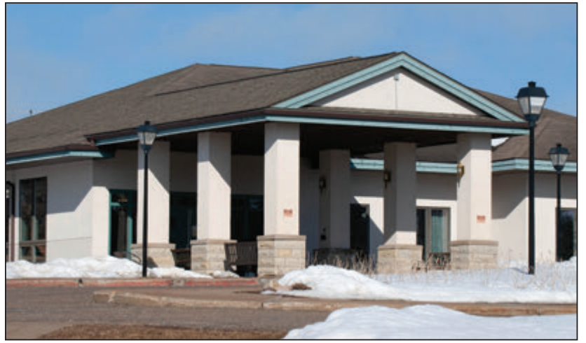
Pine Crest Nursing Home, Merrill.