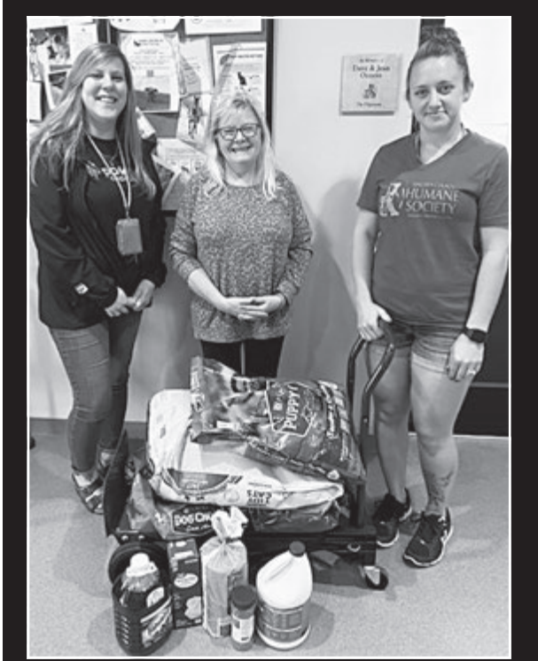
Park City Credit Union (PCCU) in Merrill held a "Share the Care" event and collected supplies for the Lincoln County Humane Shelter. Here PCCU employees bring in the food, kitty litter, and cleaning supplies they collected. Submitted photo.